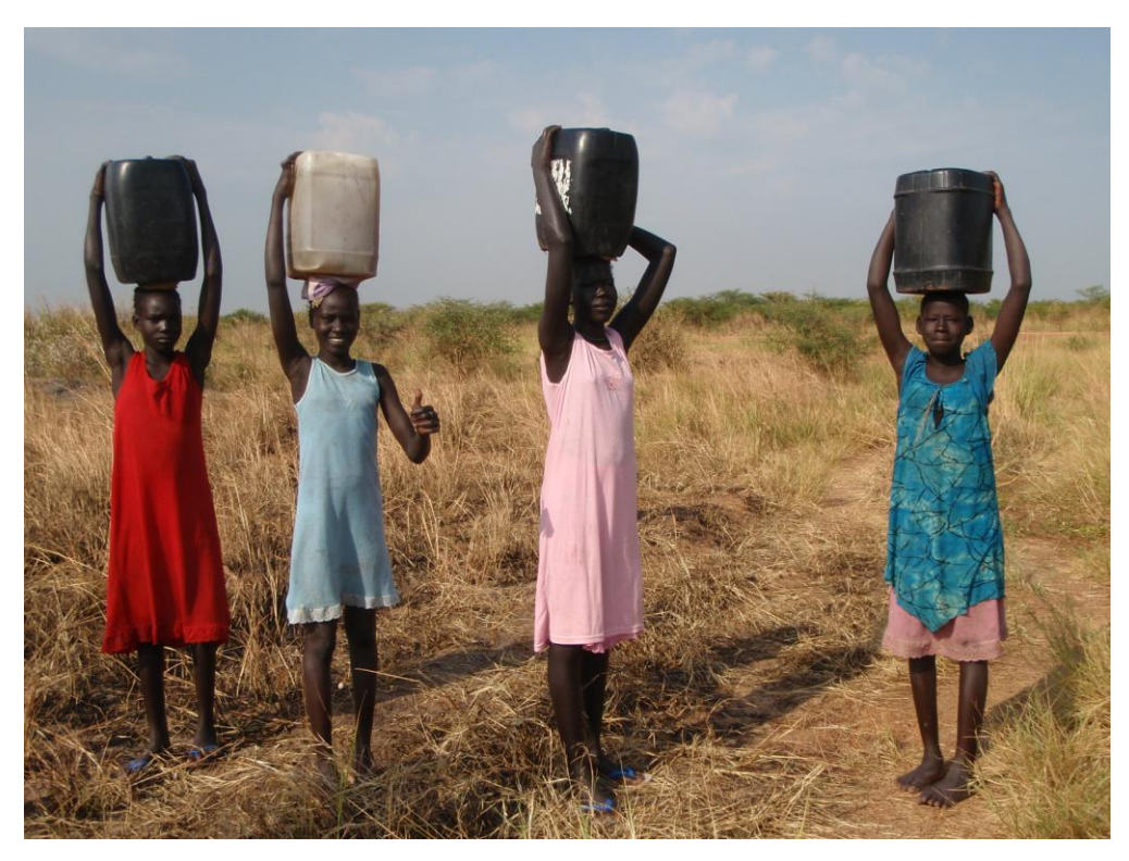
Young girls from the village of Gaik collecting water