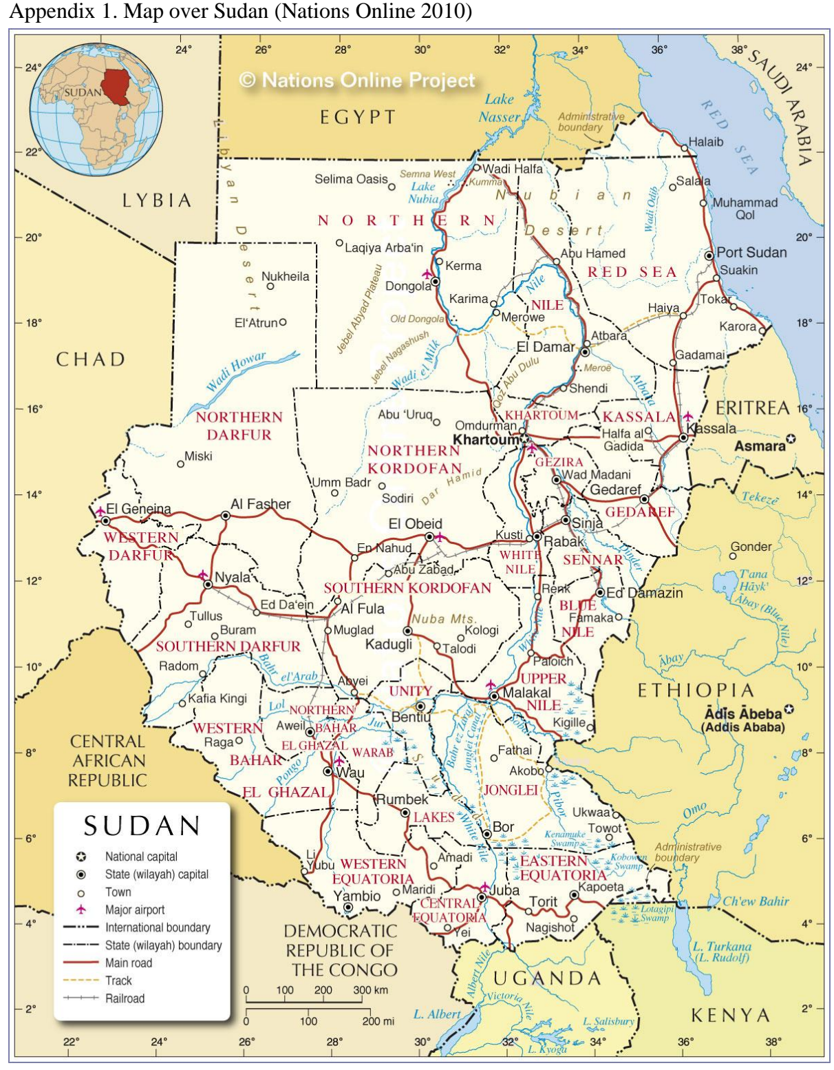
Appendix 1. Map over Sudan (Nations Online 2010)