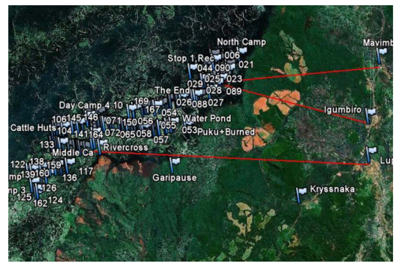
Fig 2. The example map with Mavimba, Lupiro and Igumbiro showing on the map with red lines, wore the straight lines in kilometres used in the calculation of length from the closest mapped villages. The map also shows roughly the distribution of agriculture seen as brown and red patches with scattered miombo woodland in between and alongside the border-line to the floodplain itself. Note that some of this agriculture is actually in the lowland, appearing in the darker areas to the west, hence in the actual floodplain. This map is from the northernmost study area where one conducted studies across 10 more or less randomly picked transects in the KGCA.

the Ulanga district side. These villages wore Idunda, Igota, Igumbiro, Ikonguawa, Ilagua kati, Ilagua Mission, Itete, Kichingani, Kigualo, Lupiro, Mavimba, Milola, Minepa and Nakafulu. The villages that one also had on relatively trustworthy maps, wore used in the study to also look at the length to the study areas center, to find which ones was indeed the closest to the study areas: Igumbiro, Mavimba, Nakafulu and Kichingani and Lupiro by the northernmost study area and Itete and Lupiro (Lupiro could be considered to be in between, and was considered in both study areas) in the southernmost area. An example of the lengths that was calculated (Straight red lines) with the help of the mapsource transect data with a map-layer from google earth that included three of these villages, can be seen in figure two, under: