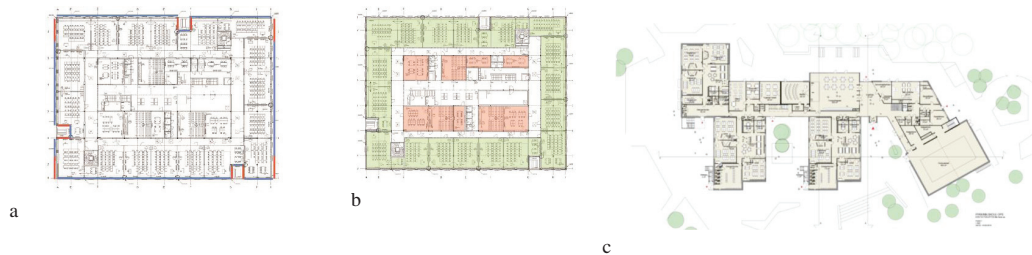
Fig. 2. Example: Marienlyst School, Drammen (a); Measuring façade meters per class, blue lines are counted, while red lines are not counted. The average FMC for this school was measured to be 9.4 m (168.6 façade meters/18 classes). (b); This illustration demonstrates the amount of teaching area without direct daylight access. Teaching rooms with daylight are colored green, while teaching rooms without daylight are colored red. c) The Rykkinn competition; winner project

The FMC value was developed in the earlier research mentioned above (Houck, 2013) and was defined as the façade meters spent on classroom, group study room and teaching areas related to the main teaching activities – divided on the number of school classes the respective school was dimensioned for . We are interested in measuring the façade meters that can be distributed into various rooms and provide daylight. Therefore, the first 8 meters around a corner are not counted, as this would only provide the possibility for daylight in a room where we have already measured an outer wall. See figure 2a.