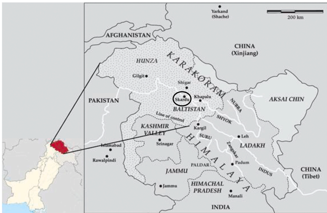
Fig. 1. Map of northern Pakistan showing Skardu's location in Baltistan.