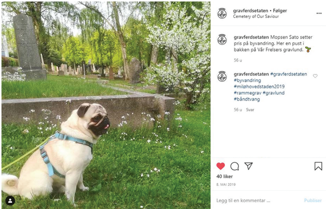
Figure 2. An Instagram post by Oslo’s Cemeteries and Burials Agency showing a dog on a leash in Vår Frelser’s cemetery. Comments from other users are hidden for anonymisation purposes.

management aims to communicate rules of behaviour to visitors, both through signs and the help of gardeners. Stronger communication strategies function similarly to increased physical access and lighting by reducing the extent of the liminality of cemeteries as public spaces.