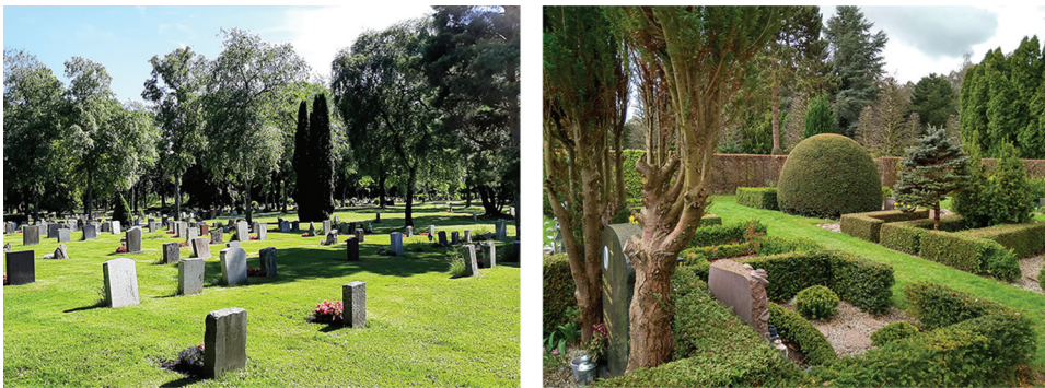
Figure 1. Typical cemetery landscape: left – open grassland in Nordre cemetery in Oslo (June 2020), and right – graves surrounded by hedges in Bispebjerg cemetery in Copenhagen (April 2018).

The cemeteries in both cities are park-like environments with natural components, such as grass, trees, flowers and sometimes water features. However, they have a unique character (see Figure 1). Oslo's cemeteries are characterised by open grassland with rows of uniform gravestones, whereas