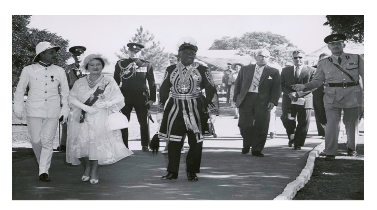
Figure 2: Picture of His Majesty King Mwanawina III, with the Queen Mother of Britain visiting Barotseland in 1960.

As a pre-colonial nation, Barotseland is also understood to have been the most politically centralized and socioculturally coherent society. No wonder, then, that its people have always had an inherent sense of Lozi 'national consciousness' which has been the source of inspiration of their quest for political sovereignty (Caplan, 1968). That the Bulozi Kingdom evolved out of a citizen and subject paradigm, in which minority tribes were coerced by the more dominant, is the most characteristic feature of the historical roots of Barotseland upon which the kingdom extended its 'geographical sphere of influence', subsequently cementing its regional autonomy as a traditional monarchy (Sichone & Simuntanyi, 1996). There has been a tendency to portray Barotseland's political institutions as if they were static, when in fact the kingdom's governance system was largely based on well-organized institutional structures of central authority. It is this authority which enabled the Litunga to establish 'bilateral links' with other territories as well as gain recognition as Head of the Barotseland nation by the British government. Some scholars have actually argued that Barotseland had an "endogenous democratic-like" system of inclusiveness, such that "all tribes had equal representation and participation in spiritual, military and judicial roles, although the supremacy of aristocratic heredity flourished" (Mufalo, 2011:2).