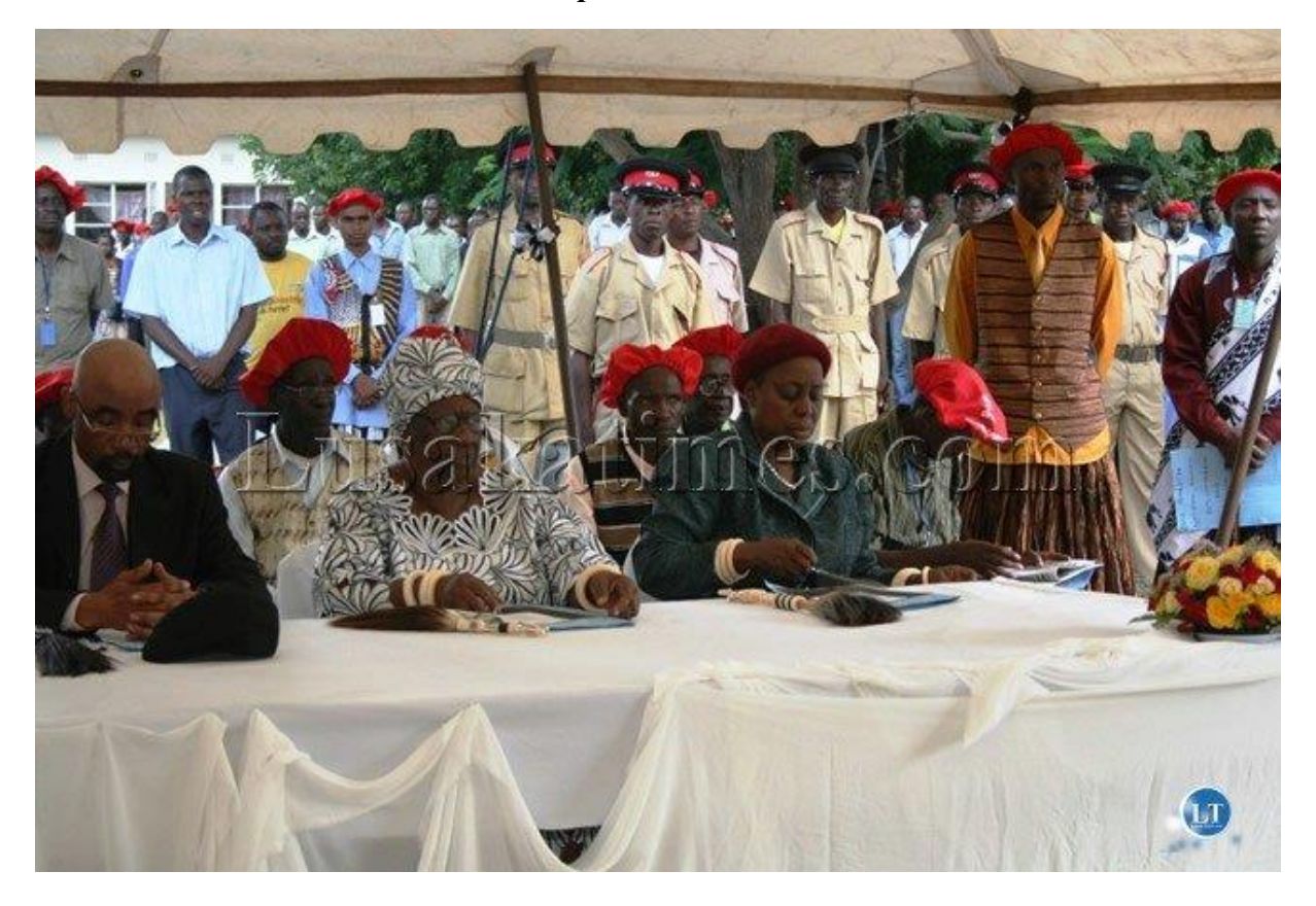
Appendix 2: Delegates at the 2012 Barotse National Council indaba held at Limulunga on March 26-27; where Barotseland's Independence was declared