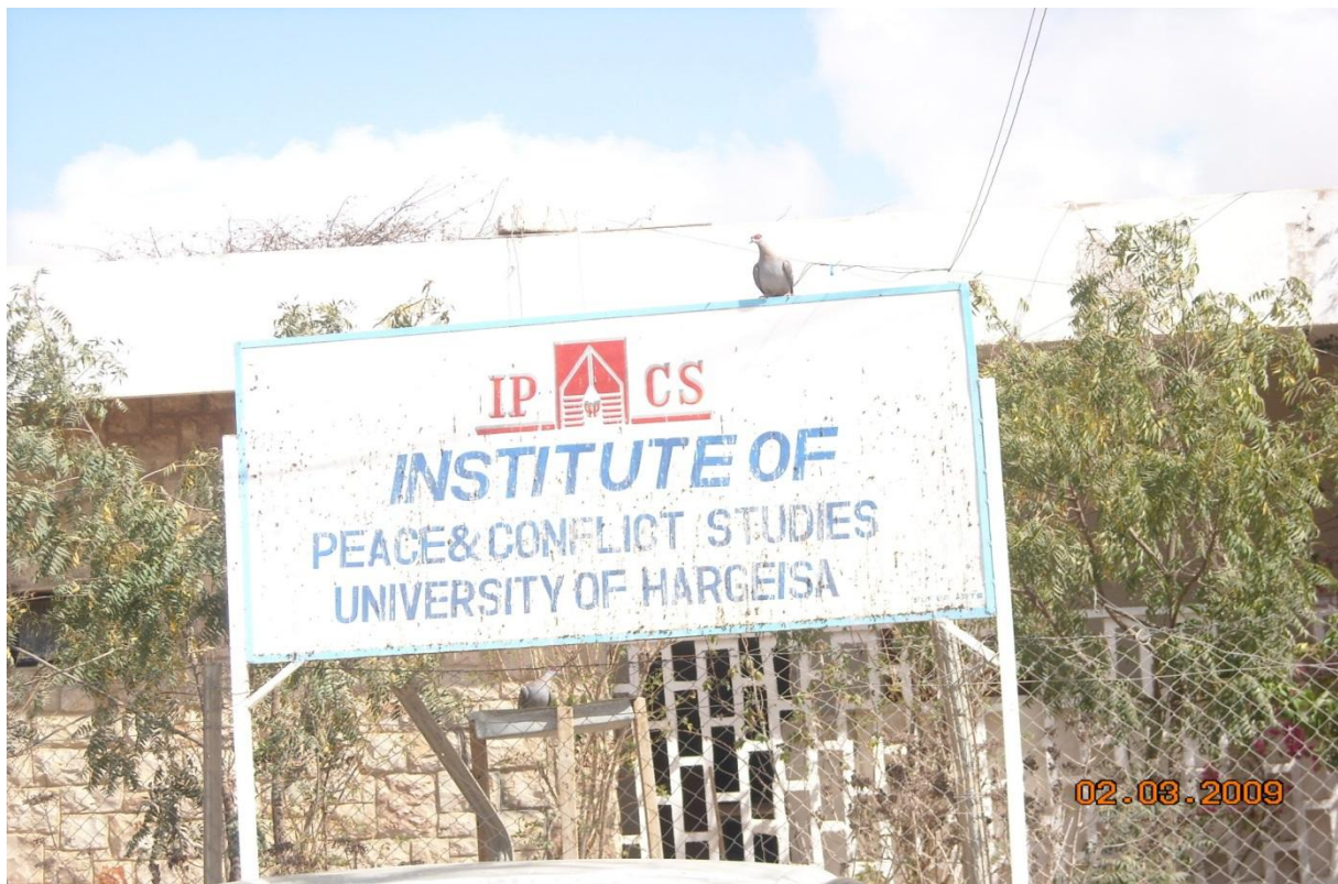
Picture 6: Institute of peace & conflicts studies University of Hargeisa