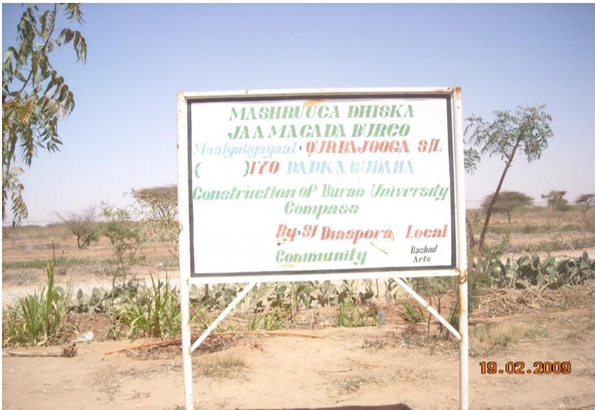
Picture 2: A sign about Diasporas contribution on the construction of the University of Burao