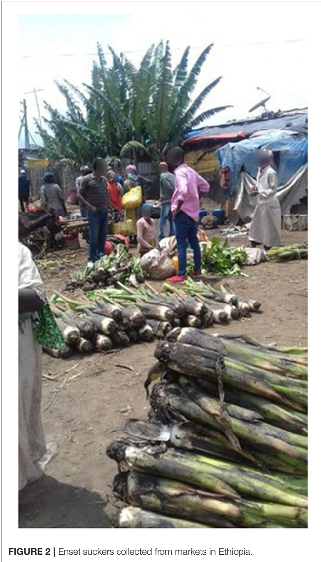
FIGURE 2 | Enset suckers collected from markets in Ethiopia.

transformation so that the data conformed to normal distribution (Zuur et al., 2010). The association between nematode density and altitude was analyzed using Pearson's correlation analysis.