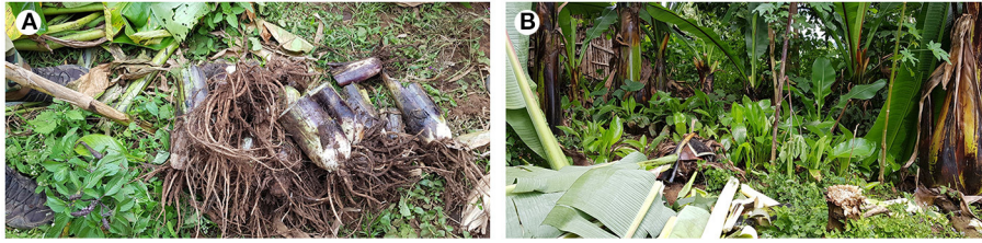
FIGURE 1 | Enset suckers (A) (B) collected from farmers' nurseries in Ethiopia.