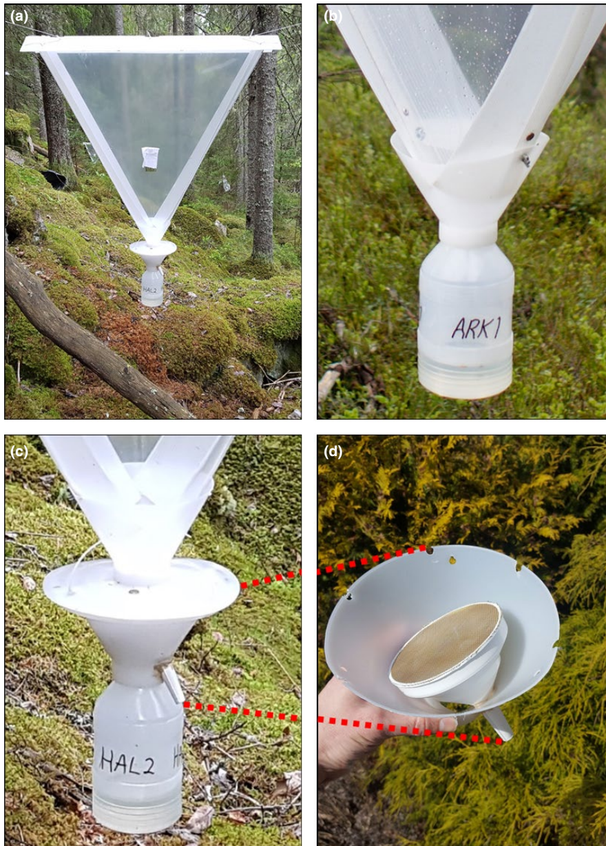
FIGURE 2 Flight intercept (window) traps placed in Norwegian forests to sample beetle communities (a). These Polish LBL-2 traps are designed and produced by CHEMIPAN (Warsaw, Poland). Each trap is fitted with a bottle of propylene glycol to preserve insects that are captured. Rainwater often dilutes the glycol and overflows the bottles even when drainage holes are in place. To test a trap modification meant to eliminate this problem, two types of trap were placed at each site: standard traps (b) and traps with a rainwater draining device (c). This device (d), designed by the Department of Forest Protection, Forest Research Institute (Sękocin Stary, Poland), funnels rainwater out of the spout, protected by a screen to retain captured insects. These insects must then crawl around the screen to fall into the collection bottle.