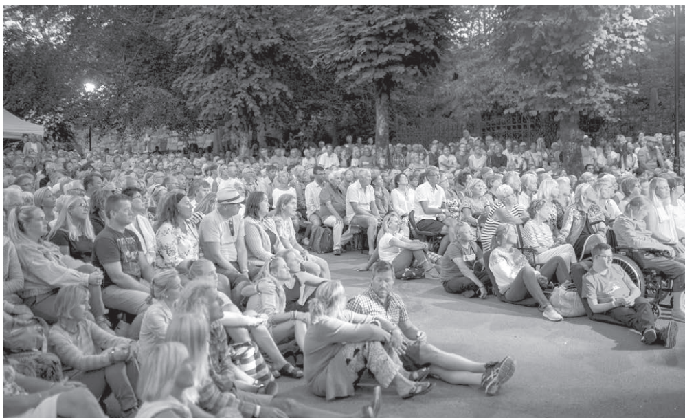
Figure 1: The audience at the concert of Sigvart Dagsland as part of the Canal Street Music Festival. Arendal Cemetery, Norway. July 2018