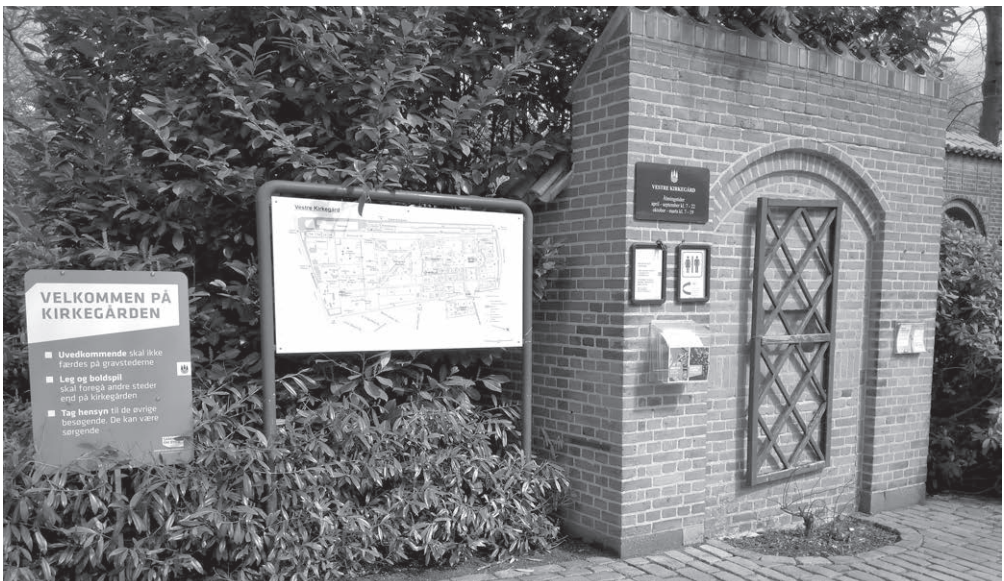
Figure 4: Information point near the entrance to Vestre Cemetery (from left to right): "Welcome to the cemetery" sign with guidelines for visitors' behaviour, map of the cemetery, and leaflets. Copenhagen. May 2018

A cemetery in general should also be kept "properly": for example, public roads and pedestrian paths cannot be built to cross a cemetery; a cemetery should be fenced; and the aesthetic values of a cemetery and its relationship with the church and surroundings should be preserved. Copenhagen cemeteries have information boards prescribing rules for visitors' behaviour (see an example in Figure 4): unauthorised persons are not allowed to move in the burial grounds, play and ball games should take place in a location other than the cemetery, and visitors should take into consideration the bereaved.