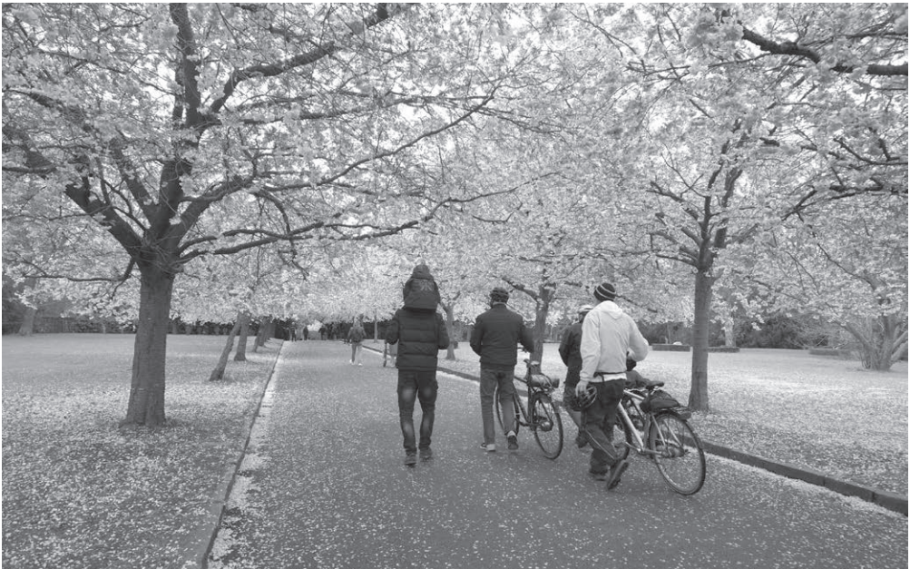
Figure 8: Cherry trees blossom in Bispebjerg Cemetery, Copenhagen. April 2018

Both cities adopted their strategies quite recently, and thus it is too early to analyse their full implications. However, we have made some observations which support our findings. During the programme of the European Green Capital in 2019, the Oslo Municipality chose a cemetery gardener as an "ambassador". He shared his experience of the "green shift" in cemetery management, including the use of electric machines (Oslo Municipality 2019b). In Copenhagen we noticed how the Municipality has facilitated recreational activities at the cemeteries, including provision of extra toilets, trash cans and information signs to accommodate visitors who came to see cherry trees blossom in Bispebjerg cemetery (see Figure 8). Nevertheless, how the strategy might shape the future of the cemeteries requires additional study.