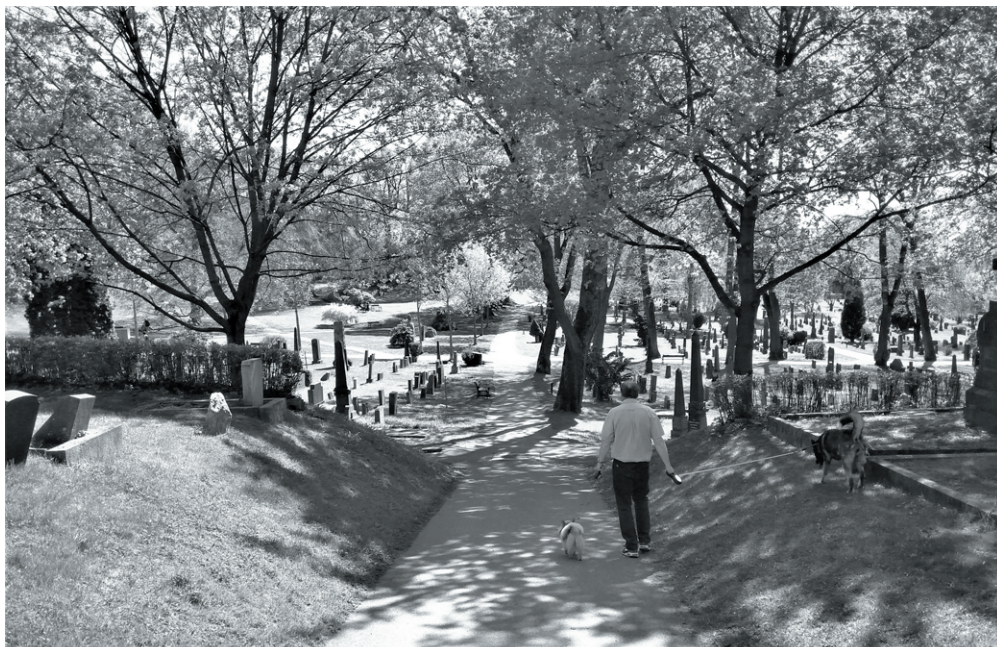
Figure 7: A visitor walking dogs in Vår Frelzers Cemetery in Oslo. May 2018

The authors of Copenhagen’s strategy note that despite a lack of intentional planning for it, recreational use of cemeteries has increased in recent years. In Oslo, while recreation is visible (see Figure 7), it is not recognised in official planning and management documents. According to our interviewee from the Department of Culture and Sport, the Oslo Municipality wants to understand “how we, as a city, can develop them [cemeteries] so that they’re more in line with what people actually use them for” (Interviewee 3).