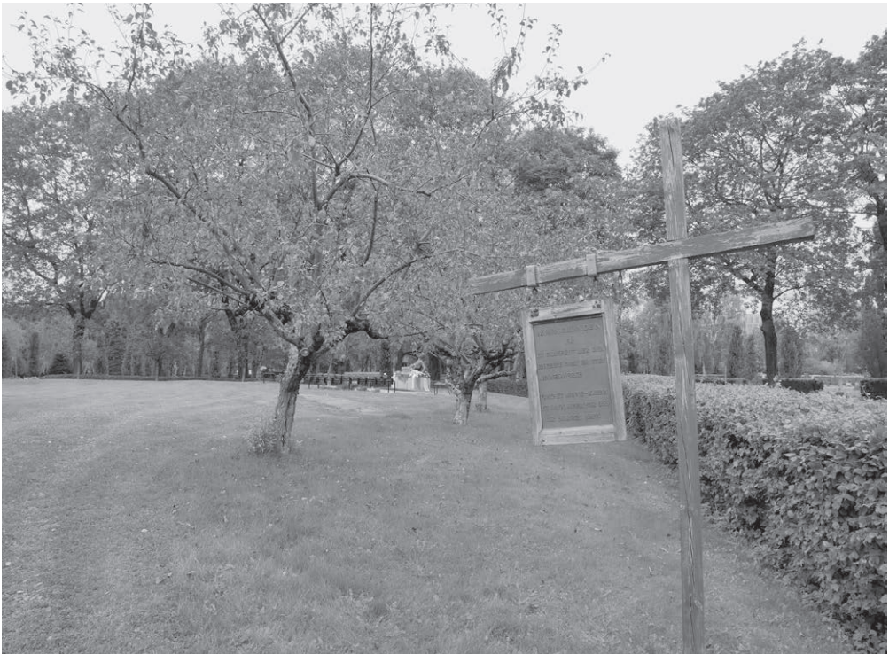
Figure 3: Anonymous memorial in Østre Cemetery in Oslo. The sign says: “The memory grove [literal translation of the Norwegian word ‘minnelund’, anonymous memorial] is a burial ground where individual graves do not have inscriptions. Capture a memory, feel grief – for each of us sorrow has a different name”. September 2019

Along with traditional coffin graves, Oslo cemeteries also offer large areas for cremated remains: individual and shared ashes burials, including anonymous memorials (see Figure 3). The cremation rate in the city is 75%, much higher than the national rate of 43% (Norsk forening for gravplasskultur et al. 2019). As outlined by Hadders (2013), potential explanations for the differences in cremation rates around Norway might be a lack of access to crematoria, additional costs of cremation comparing to coffin burial, lack of cemetery space designated for interment of ashes, and Christian traditions of funerary practice. Regulations prescribe ashes to be disposed of in the ground; other types of disposal, including columbaria, are not permitted. At the request of a relative and with a documented wish from the deceased, a regional government can grant an exception from this rule and give permission to scatter ashes (Høeg 2019). According to the laws, a grave is protected for 20 years after the burial. After this period, protection can be renewed for a fee or a cemetery administration may reuse a grave for another burial.