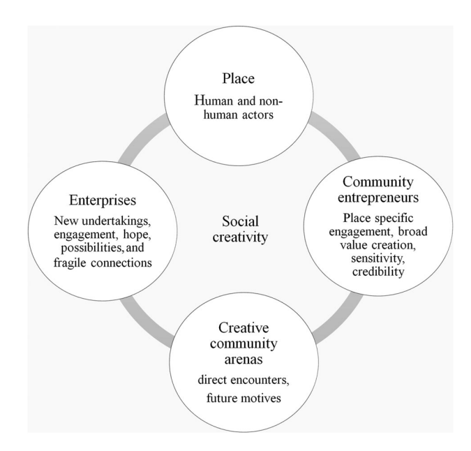
Fig. 4. The relationship between place-making and social creativity

Based on the thematic stories obtained both during my research and from the literature, in this section I present a general conceptual figure expressing the relationship between place-making and emerging social creativity. Figure 4 is not an expression of balanced components, since the component of place comprises all existing practices and actors. Rather, it illustrates a procedural context for transboundary and continuous processes involving place, community entrepreneurs and creative community arenas, and contributing new enterprises that materialize in social creativity and potentially virtuous circles. The enterprises component encompasses what has been done and what has not been done, addressing new undertakings, engagement, hope, possibilities, and fragile connections. In the following, I briefly discuss the place component, before discussing the components of