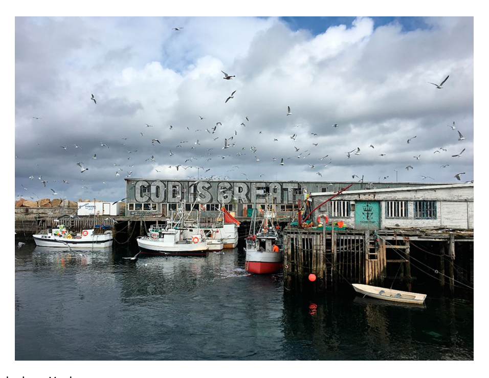
Fig. 2. Old fishery harbour Vardø

While the themes involve many different individual lifelines, actors also exist within networks. Within the thematic stories, I make connections between town festivals, entrepreneurs, the Coastal Rebellion, and Vardø Municipality, while acknowledging that many individuals mentioned in the stories are part of a meshwork of lines (Fig. 3). I also make connections to other actors