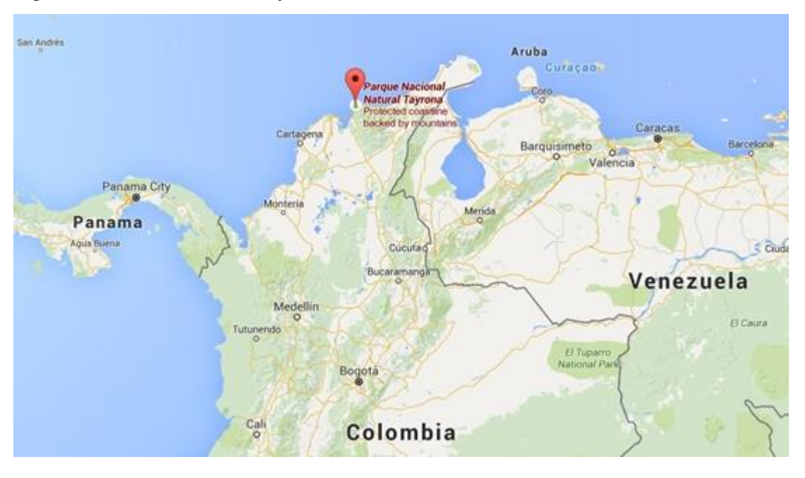
Figure 3. National Park of Tayrona.

Parque Tayrona National Park is a protected area, stretching from the foothills of Sierra Nevada de Santa Marta, and reaches all the way to the Caribbean coast. It is home to biodiversity endemic to the area, and scientists have identified an extensive array of wild flora and fauna living within the park's borders, including mammals, reptiles, amphibians, birds, sea and river fish, along with plants, and corals. Many of these animal species are listed as vulnerable, like the American crocodile, and some as severely threatened by extinction, like the jaguar (Alsema, 2017). The national park's biggest city, Santa Marta, was host to the Conference of the Parties (CoP) of CITES in 2014. The park constitutes a great proportion of issues concerning land rights to peasants who have largely been evicted from the park, indigenous communities, and strain on ecological preservation due to tourism (Leal, 2015).