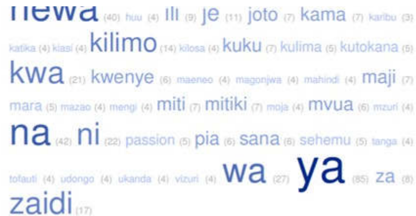
Figure 5. Word cloud after analysis using TagCrowd.

After triangulation of analysis using two word visualization tools, researchers concluded that the most frequent keywords obtained from TagCrowd almost resemble those which were obtained using the Wordle analysis tool (Figure 4, Figure 5). The keywords obtained from TagCrowd tool are: climate, weather, agriculture, soil, water, teak, forestry, rain, drip irrigation, hot temperature, crops, passion, and advisory. These keywords point to the impact of climate change. This is supported by previous literature from a study area which showed that there is impact experienced by farmers due to climate change. Mayala et al. (2015) argue that farmers in Kilosa indicated that there is change of rainfall pattern and resulted to insufficient food and rise in temperature (Isinika et al., 2016). Even though Kilosa District is experiencing the effects of climate change, a study by Mayala et al. (2015) found that farmers in Kilosa have little knowledge on climate change because one in four understand the word "mabadiliko ya tabia nchi," a Swahili word for climate change.