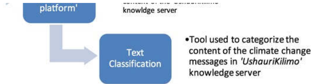
Figure 1. Data analysis process.