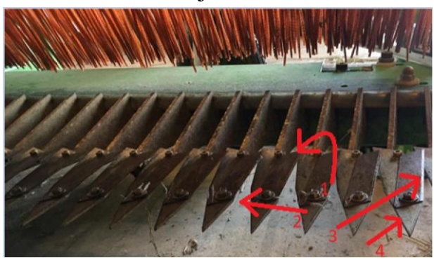
The knife angle of the CombCut is adjustable in both the horizontal and vertical plane. The angle in the vertical plane affects the opening between the knife and the knife holder. The horizontal angle will affect whether the crop/weed is guided a long the knife holder or the blade. See figure 1. The angle of the knives are adjusted according to two measures on the back of the machine.