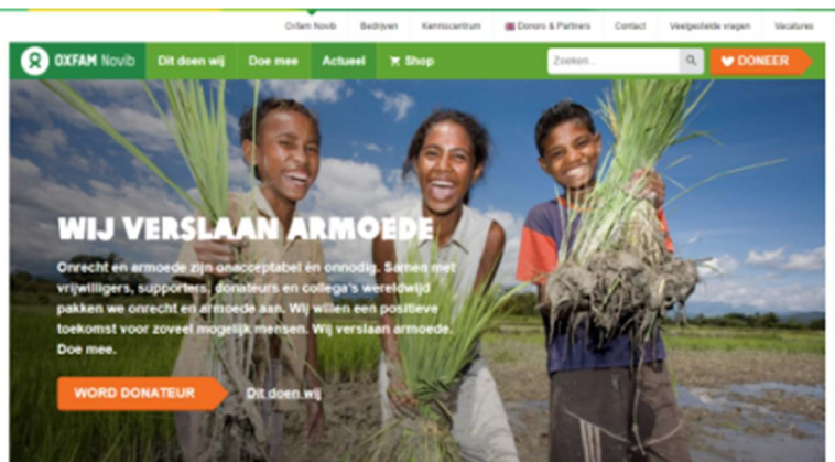
Figure 5. Homepage of Oxfam the Netherlands

“We are powerful women, hardworking farmers, ambitious youngsters, driven researchers and involved donors. We are the voice of millions. We defeat poverty”