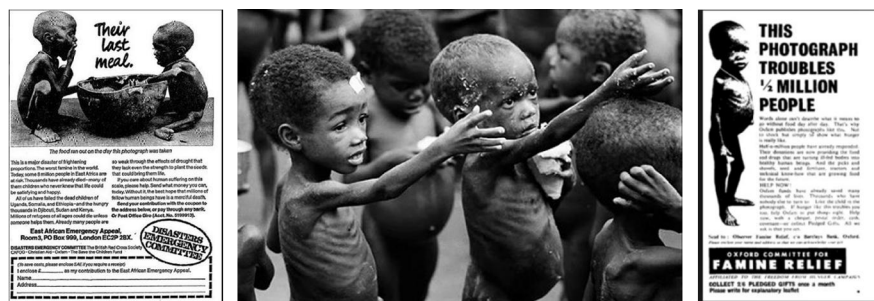
Figure 1. Pornography of poverty

The coverage of the Ethiopian famine was the beginning of what was later identified as the pornography of poverty. Close-up images of starving, half-clothed, black African children with bloated bellies and flies in their eyes started to dominate humanitarian communication, as illustrated in figure 1. It was argued to be the representation of suffering in ‘its plain reality’ (Chouliaraki, 2010, p.5). According to critics, this strategy was pornographic because it ‘puts people’s bodies, their misery, their grief and their fears on display with all the details and all the indiscretion that a telescopic lens will allow’ (Vestergaard, 2013a, p.459).