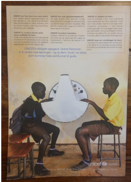
Figure 4. Brochure ‘Fremtiden formes av de med sterkest tro på at den kan endres’ of UNICEF Norway

“UNICEF’s most important task in the future is to develop new solutions – and put that into use in a scale that it benefits the whole society.”