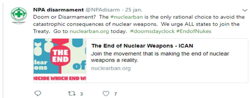
Figure 6. Twitter post from NPA

An example that illustrates how social media are used to raise awareness and create social change is a post on the Twitter account of NPA. In this post, NPA urges all states to join a treaty to end nuclear war and asks all followers to support the organization: