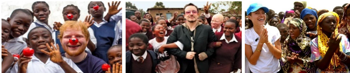
Figure 3. Post-humanitarian sensibility, with British singer Ed Sheeran, Irish singer Bono, and American actress Angelina Jolie.