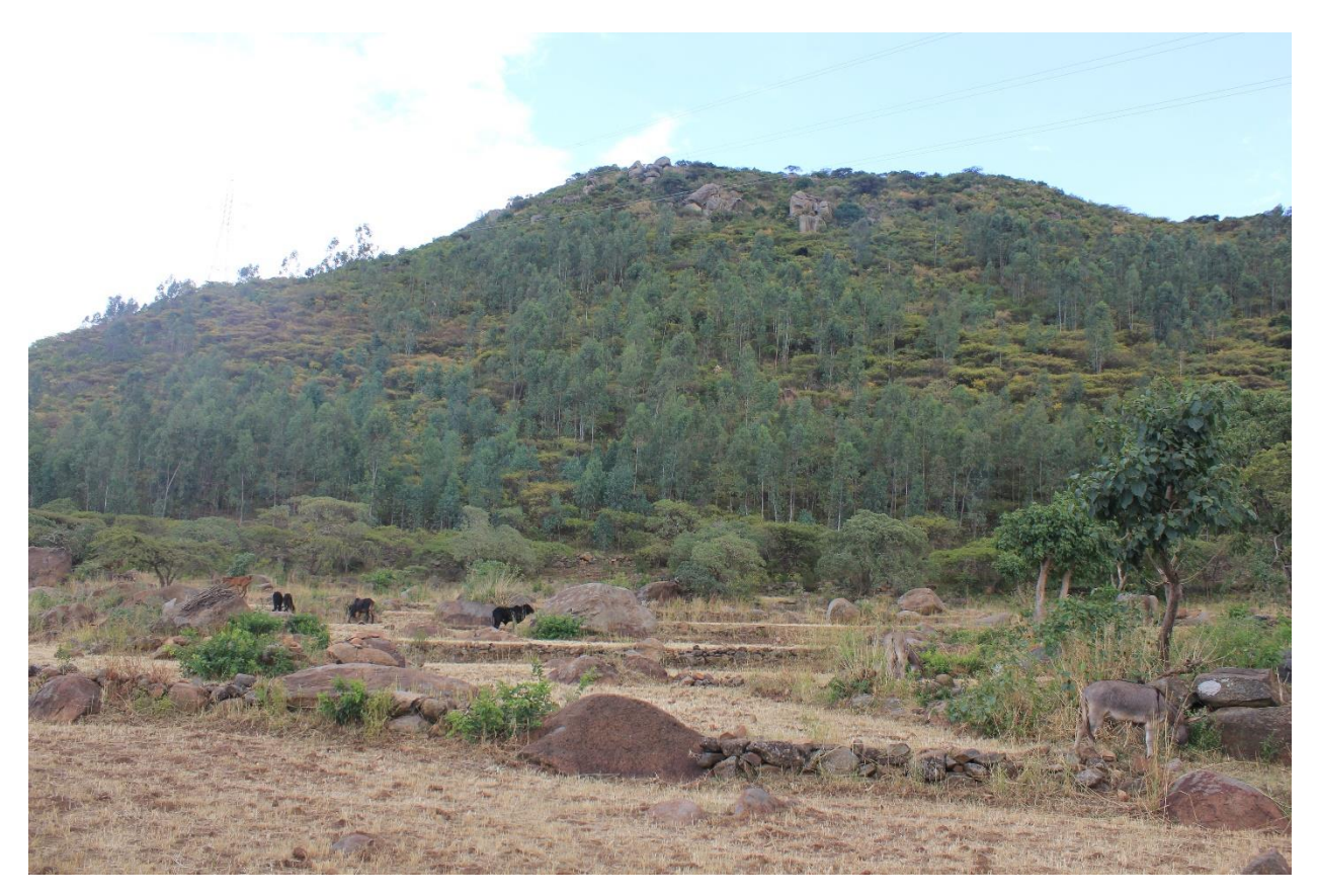
Figure 4. Area exclosure enriched with eucalyptus trees by youth group which also has bee hives and has planted bee fodder plants.

One of the challenges the youth faced was that the exclosure areas give limited income and other benefits in the first years and they therefore needed complementary income sources. The interesting finding was that a large share of those groups we visited were renting in land from farmers in the area (sharecropping) while others were construction workers. Those that had oxen were those that were able to become tenants by renting in land in the neighborhood.