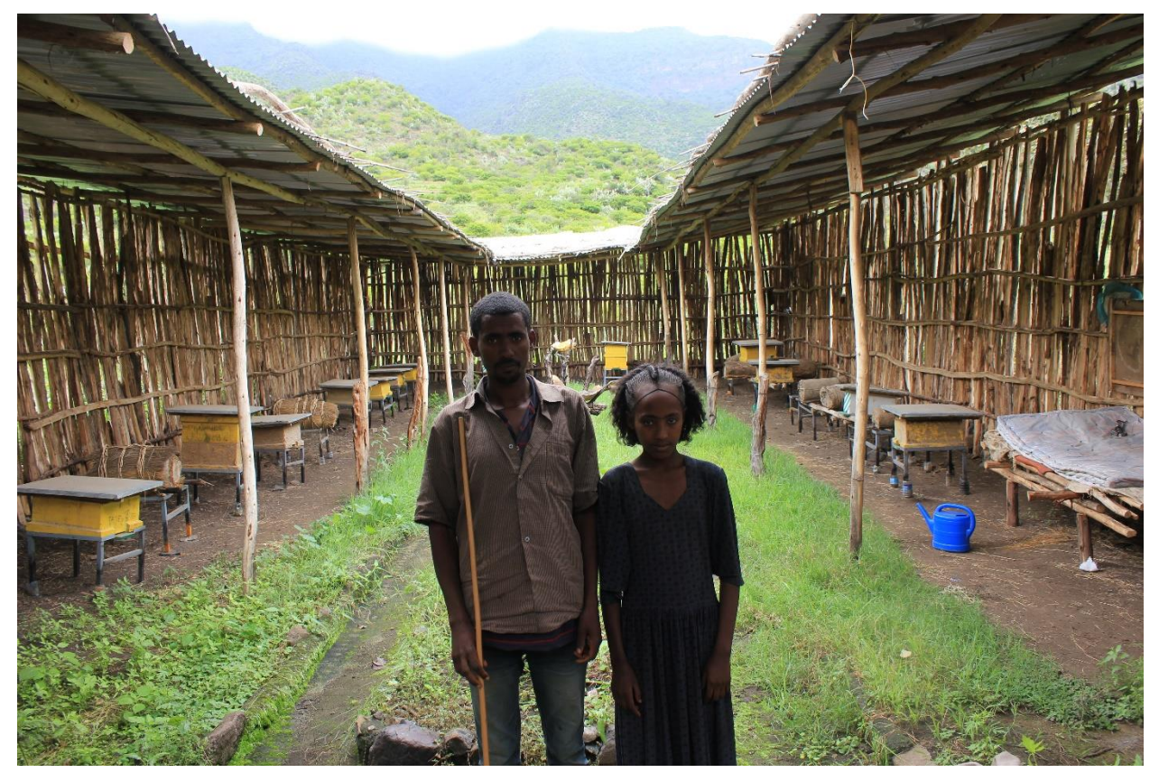
Figure 3. Youth group with bee hives in Raya Azebo.

activities involved mining of stones and sand but these groups were of temporary nature, typically for one year during which the mining should help the youth to accumulate capital for another activity and they were required to save 50% of the income in the bank. When this deposit has reached EB 20,000 per youth they have to stop and graduate and go into another business with their accumulated starting capital. They may get follow-up training for the new business they want to go into. One of the problems is, however, that these youth may want to migrate even out of the country.