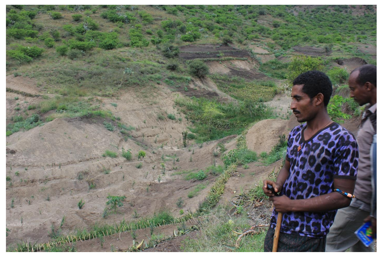
Figure 2. A rehabilitated gulley (under SLMP II) allocated to youth groups in Raya Azebo. This group has planted fruit trees and vegetables.

We visited another district in south-eastern Tigray, Raya Azebo with a population of 158,000 of which 32,000 were registered as landless youth on the waiting list for getting land. Formation of youth groups for provision of area exclosures was limited to fewer municipalities here (3 of 20) but the success of the first groups has created stronger interest among the youth themselves whose motivation was one of the most important constraints in the beginning. About 8,300 youth had been allocated about 3,900 ha. In all, more than 12,000 youth are organized in groups in the district by 2015.