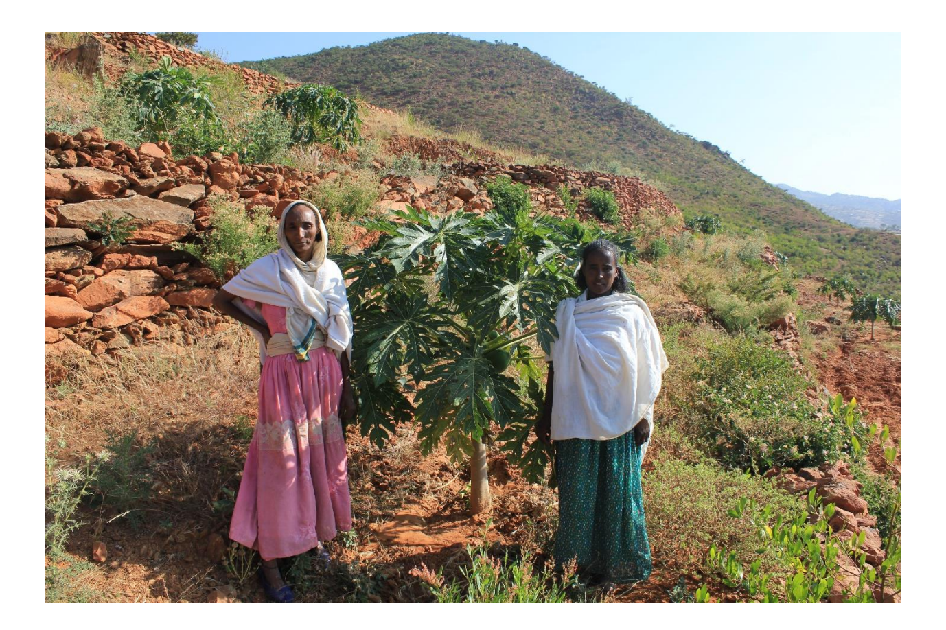
Figure 1. A rehabilitated grazing land allocated to a youth group for fruit production with irrigation in Adwa district.

We visited Adwa district in Tigray where almost all communal lands have been transformed into exclosures. The area was estimated to be about 35,000 ha out of 65,000 ha total area in the district. The total population in the district was about 113,000 of which about 16,000 were registered as landless youth. They had by 2015 allocated 1,835 ha exclosure area to 4,277 youth that were organized in groups with 10-20 members in each group. This implies that about 5-6% of the exclosure area is allocated to 4.1% of the population. And that about 20-25% of the exclosure area may be sufficient to meet the needs of the remaining registrered landless youth in the district. However, landless youth are also organized on youth groups to do other types of businesses such as mining of sand and stones and with the construction boom in Ethiopia this may be an area with bigger potential.