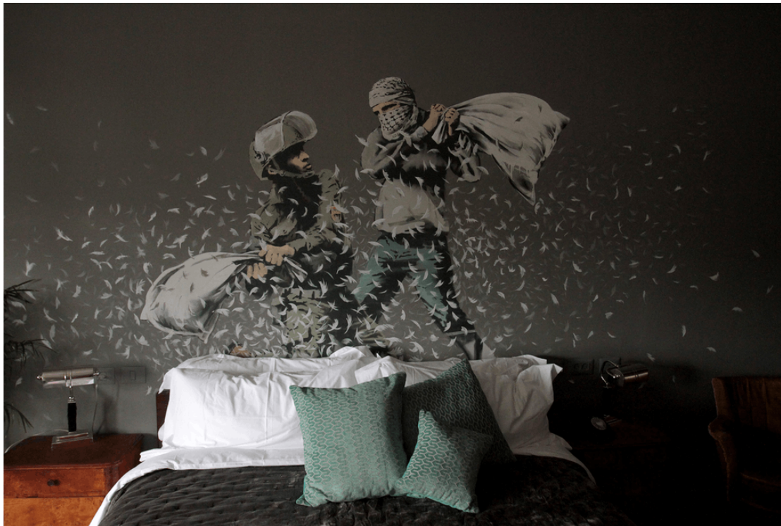
Fig.25 Flying feathers: The Arab-Israel pillow fight