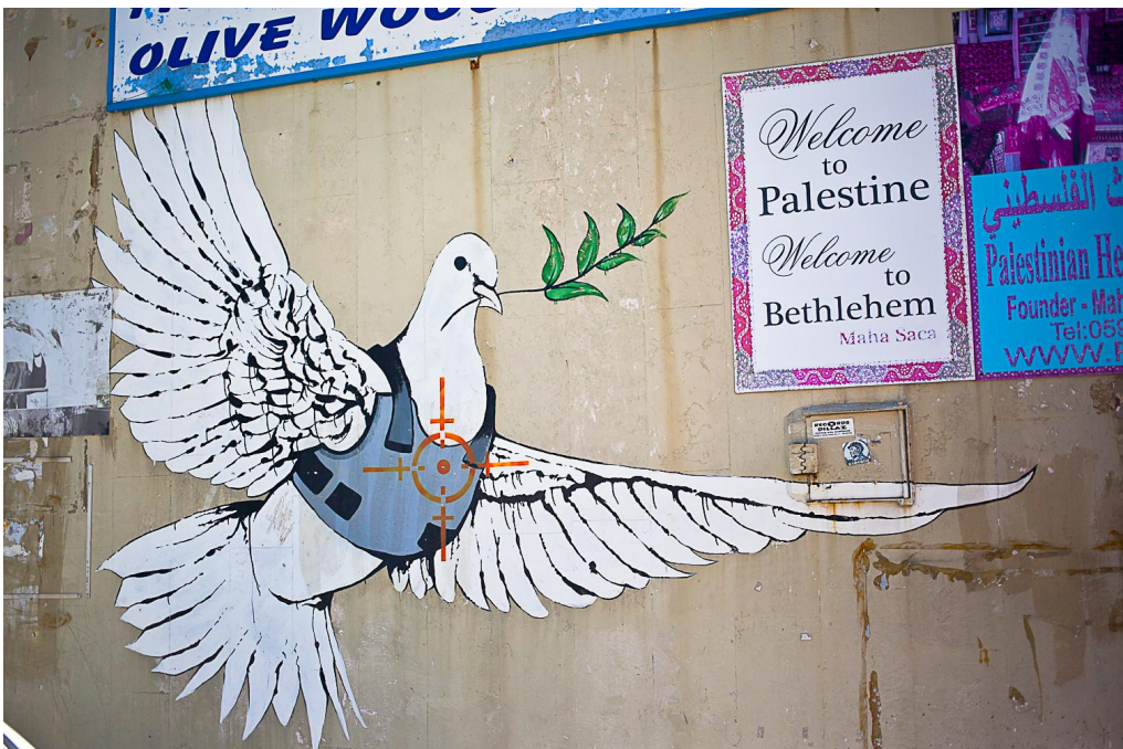
Fig.23 Aiming for the kill