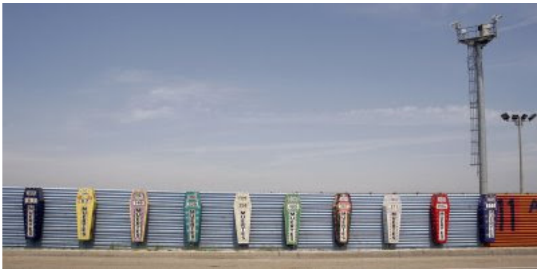
Fig.16 Coffins on the Wall

A recurrent theme in the artistic portrayals of the US-Mexico Wall is death. Many works have been created to draw attention to the deadliness of the barrier, as additional fencing and buffering measures have diverted human smuggling traffic eastward, into more hazardous terrain posing greater risk of fatality. The border art projects function as a protest of the US government's bordering policies, as well as memorial works to honour the lives lost in the attempts to overcome the border. One such project sought to transform a section of the wall into a graveyard to memorialise the dead and the suffering inflicted by the wall. The collection of coffins are aligned and physically affixed to the wall as a protest to Operation Guardian , each coffin representing a year and the number of deceased. The installation, thus, becomes part of wall's material and lived reality, the vivid colours of the coffins inescapably demands the attention of those who encounter the work (Berestein 2009; Nicol, 2008).