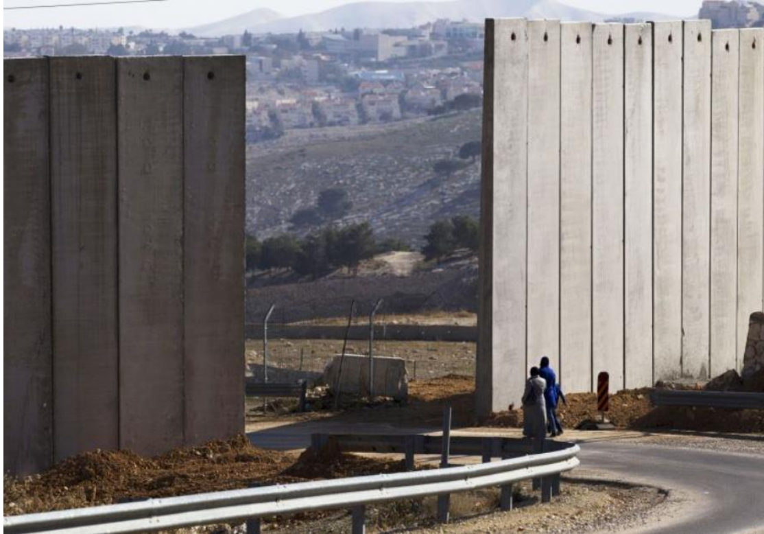
Fig.11 A glimpse of horizon between 8 meters of concrete