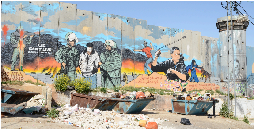
Fig.20 Graffiti on the West Bank Wall

There are many different motivations to draw or write on a wall; moreover, graffiti is both local and transnational in nature and may be carried out by artists both near and far from a particular borderscape. In the case of the West Bank, graffiti on the wall has become a medium to articulate certain emotions such as grief, fear, hope and please for peace; experiences such as sense of exclusion or subjugation of social control mechanisms and other discontents with the ‘politics as usual’ (Peteet 1996). Because it is a non-institutionalised form of political engagement, it is often criticised as illegitimate and attempted alienated by those who seek to maintain their privilege or current status quo (ibid; Waldner & Dobratz 2013). Hence, graffiti as an artefact of cultural production and as a deployment of political resistance in the West Bank has developed within the social space of its borderscape, power struggles, restrictions and possibilities. The works are created with intent and underpinned by subjective experiences through the use of certain imagery and symbolism. They potentially reach multiple and dispersed audiences who, in turn, subjectively interpret the signs and attaches meanings to them. What is essential is that the reading of graffiti, as with any border art, seeks to go beyond the limiting binaries that have produced the conflict in the first place (Peteet 1996).