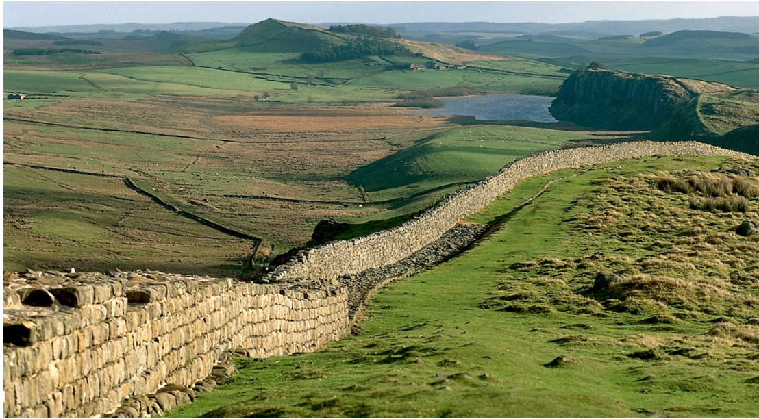
Fig.2 Hadrian's Wall

Of all the great walls ever erected, the 20 th century counterpart, the Berlin Wall, is perhaps of greatest notoriety and political significance to the overall context of this thesis. On the morning of August 13, 1961, the German people awoke to discover that what they had previously considered “an improbably possibility” had turned reality. Operation Rose , carried out by the East German side and endorsed by the Soviet Union’s military command, effectively cut a city of four million residents in two, its crossing lines sealed with concrete posts and barbed-wire fence. The underlying motivation was to construct a defensive wall to guard the socialist system of East Germany from external forces and the expansionist global capitalist economy spearheaded by superpower US. The initial and hastily constructed ‘first generation’ of the wall and its accompanying checkpoints eventually became the symbol of the Iron Curtain. Not long after, a second, third and fourth generation of wall-design ensued. The gradual work to improve the barrier’s practicality and effectiveness resulted in the Berlin Wall eventually comprising 45,000 concrete slabs, each measuring 3.6 metres in height and 1.2 metres in width, spanning a total of 54 kilometres and with a price tag exceeding $3.6 million (Chaichian 2014: p.129-147). The social price of the separation, however, was immeasurable; during the following twenty-eight years, Berlin was truly a divided city, segregating families and friends