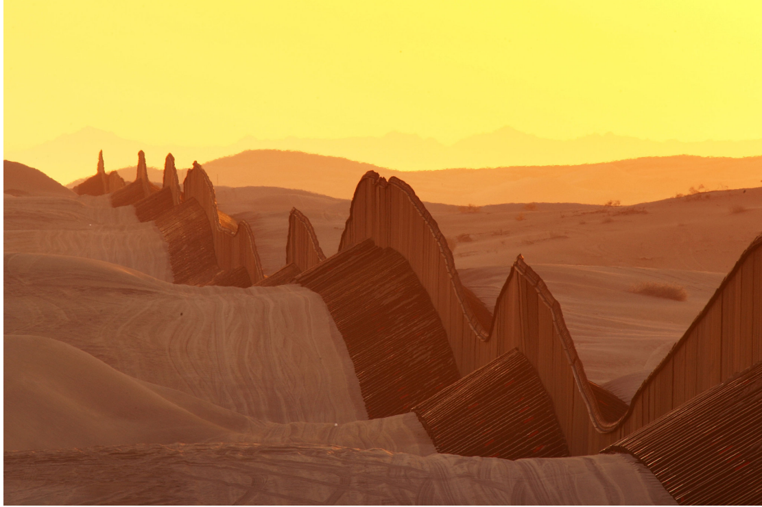
Fig.6 'Loch Ness' of the border