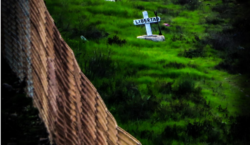
Fig.18 Death of Liberty