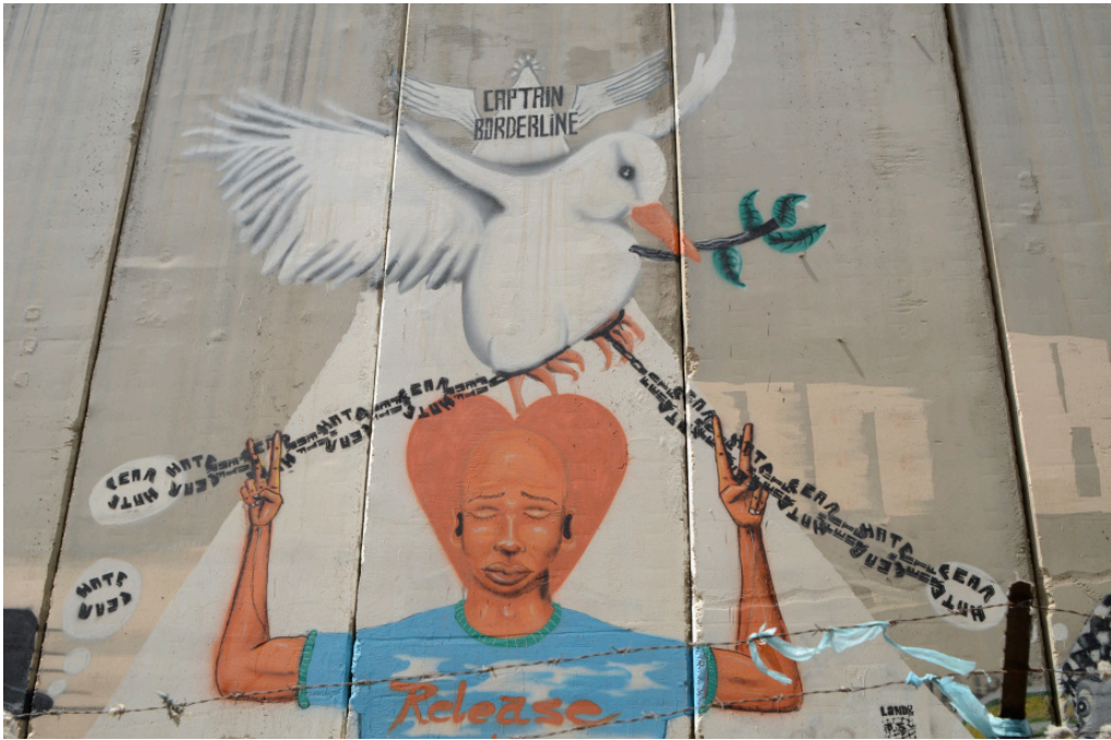
Fig.22 A peace dove in chains