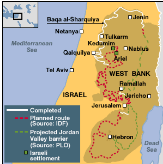
Fig.9 The completed and planned wall