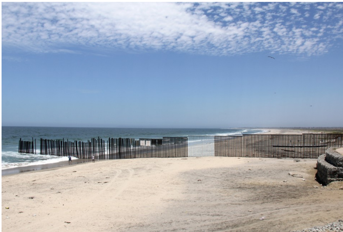
Fig.15 The final result