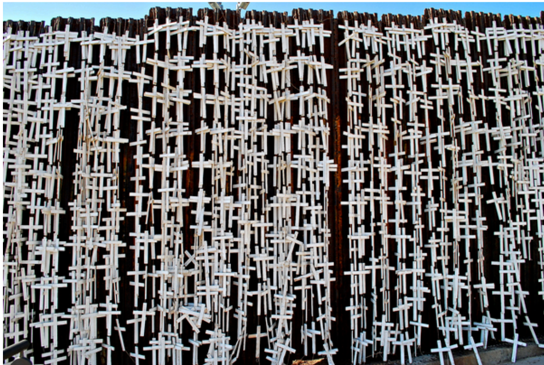
Fig. 17 Crosses on the Wall

portraying the border as a large, open fleshy wound. This relates back to Di Cintio's (2012) recount of the Wall Disease syndrome. The work can be seen as a visual confrontation with this societal illness, its ill-fated symptoms and wounds the landscapes and the people within them. Numerous other works paying tribute to the theme of death have been enacted in the contested borderlands. In the late nineties, for example, on the stretches of the wall intersecting the beaches of Tijuana, over 5000 white wooden crosses were hung along the fence in the late nineties by activists opposing the federal measure Operation Gatekeeper aimed at hardening the border (Berestein 2009). Another artist, Susan Yamagata, exhibited giant paper mâché boots decorated with the quintessentially Mexican motif of a skull. One of the shoes had the question ¿Cuántos mas? / "How many more?" inscribed on it (Berestein 2009). The display, visible along the stretched towards the airport, served as a grim reminder of the hazards of crossing the border for all those who cannot afford the privilege of a planeticket.