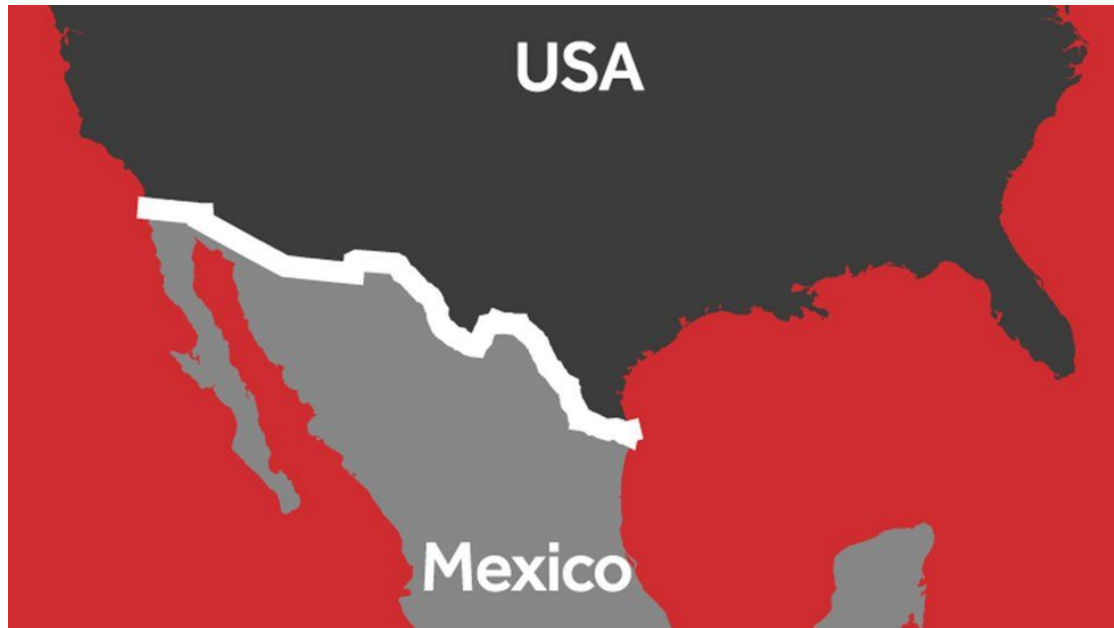
Fig.8 No borderland left un-walled: Trump's vision