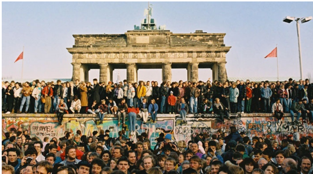
Fig.4 Ecstatic crowds swarm the wall, Nov 9 th 1989