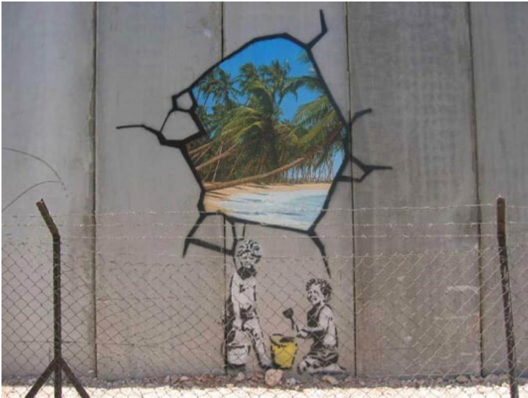
Fig.27 Banksy's mural on West Bank Wall laden with contractive irony.

-Leonard Cohen (1992) "Anthem" (The Future)