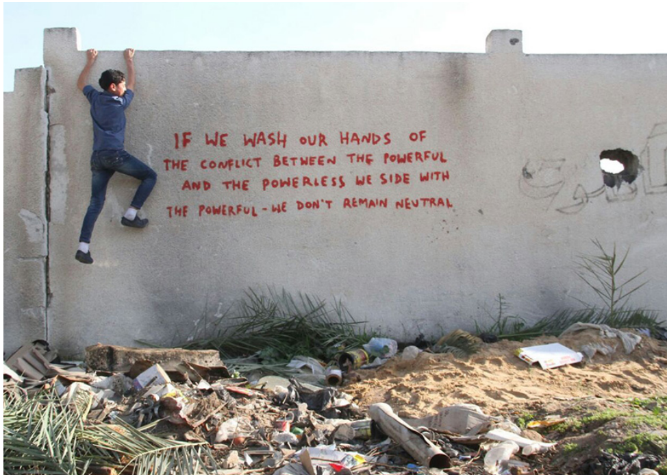
Fig.21 Message on the wall

The image of the dove carrying an olive branch is a particularly popular and prevalent image used by border artists. It makes reference to the Abrahamic tale of the great flood, a story that is central to the teachings of Islam, as well as Judaism and Christianity. Moreover, it has become a powerful symbol of peace. In the West Bank, this image is rarely portrayed alone; most commonly it is accompanied by a message or embedded into a larger piece. The depictions may carry evocative statements such as calls for unity and peaceful co-existence between Palestine and Israel or contempt and sense of abuse and oppression by a neighbouring Tyrant. Examples include the portrayal of a dove, with its wings stretched out and nailed to the wall, a reference to the crucifixion of Jesus and a strong message of betrayal and brutality. There is also an image of the dove wearing a khaki combat vest and with crosshairs painted over its heart (Toenjes 2015: p.61). The works are typically embellished with deep symbolism with religious, political and communicative sway.