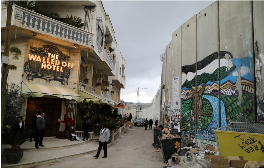
Fig.24 Welcome to the Walled Off Hotel