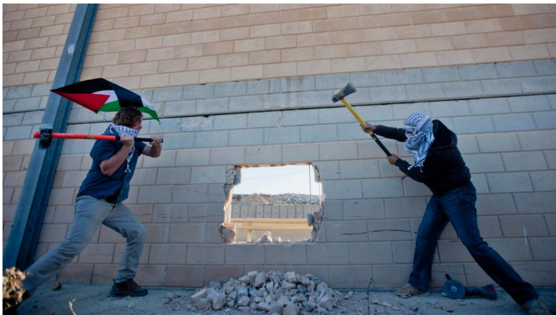
Fig.12 Activists breaking through the wall