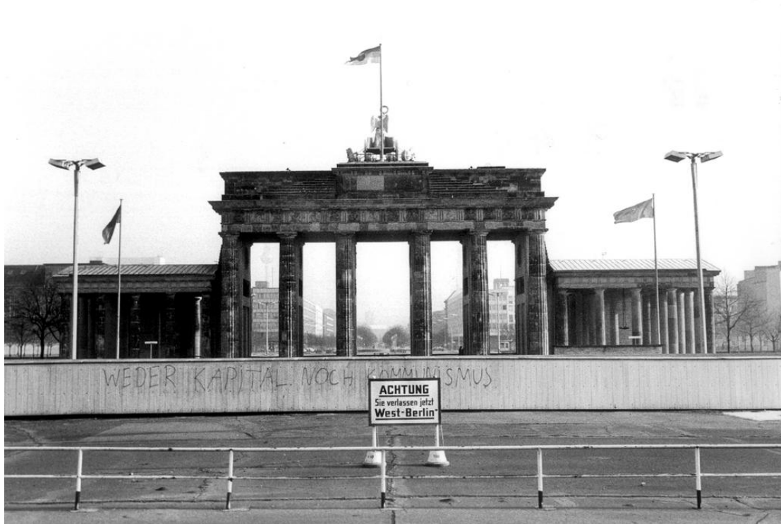
Fig.3 The Berlin Wall, Brandenburg Gate