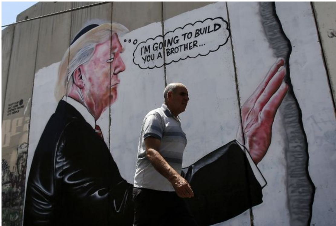
Fig.7 Teichopolitical brotherhood