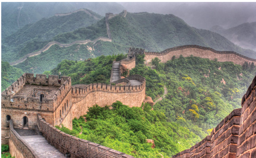
Fig.1 The Great Wall of China

such teichopolitical management strategies were decidedly mixed at best and ill-fated or ruinous at worst; no wall has, in political terms, endured the course of history (Chaichian 2014; Andrews 2016). Of the many great walls constructed, the most famous is conceivably the ancient imperial defensive barrier known as the Great Wall of China. Initial northern sections of the wall are thought to have begun around 600 th BC and thereafter expanded and rebuilt over the next 1700 years. Starting in the 3 rd century BC, work on the wall was initiated by the Qin Dynasty and later continued by the Ming Dynasty (Chaichian 2014; Andrews 2016). This magnificent and gigantic wall spanned almost 9000 19 kilometres and was so impressive that it birthed the widespread universal myth that it was the only man-made structure visible from space. As it turns out, this is a mistaken assertion; however, The Great Wall of China remains the longest wall ever erected and today the remainder of the wall provides a staunch reminder of its history, magnificence and architectural grandiosity. The wall is considered to be one of the world's 'Seven Wonders', is included in the World Heritage List (UNESCO) and serves as one of the most popular tourist destination in the world.