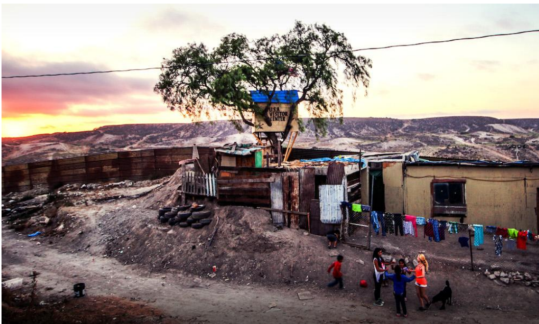
Fig.19 US Visitors Centre