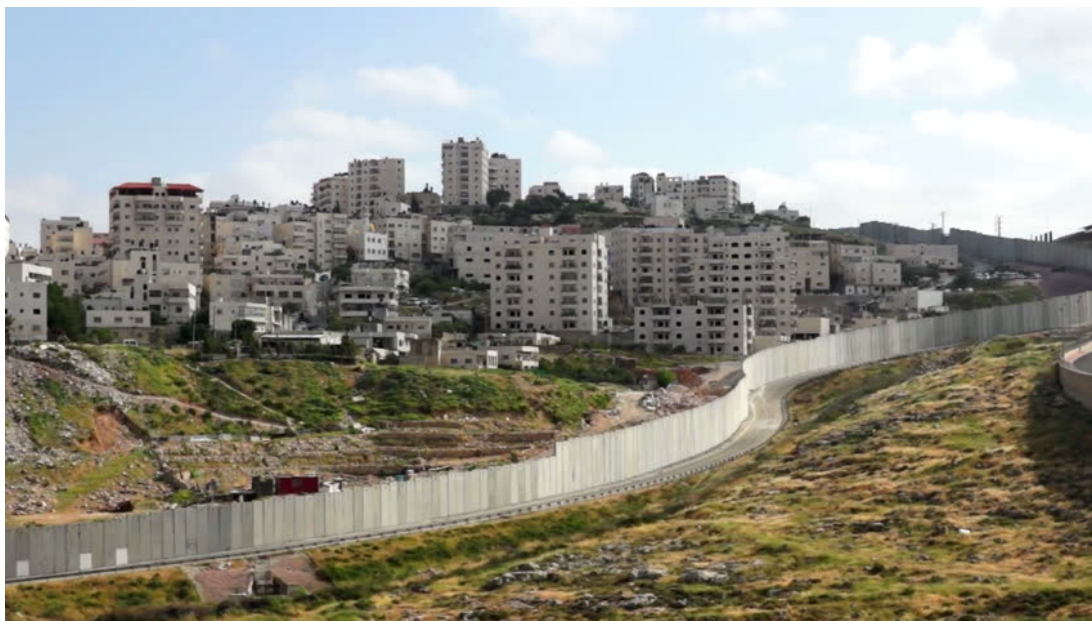
Fig.10 Stark contrasts in a divided landscape