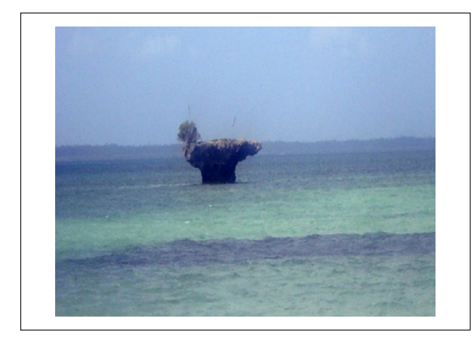
Figure 2. View of Mtowebwe reef from Jibondo Island.

unfavorable for marine life and fishers, as expressed by an elderly fisher at Chole: