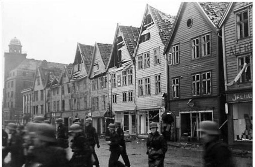
Bryggen during WWII.

Bergen was occupied by the Germans during the World War II, from 1940 to 1945. Many buildings at the site were destroyed due to an explosion during the time. After the WWII, many houses were destroyed and about to decay. In addition to the locals' negative attitude against the Germans after the war, most of the locals were against conserving Bryggen.