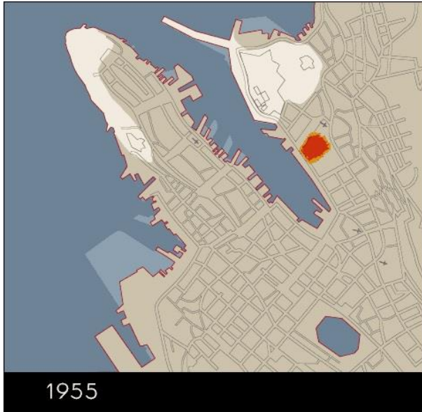
Where the fire took place in 1955.