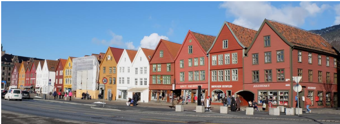
Front area of Bergen.