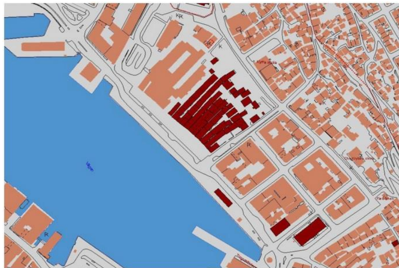
The protected buildings at Bryggen.

The remaining buildings at Bryggen are around 300 years old, from rebuilding after the destructive fire in 1702. However, the findings from the excavations proved that the area had settlement already from the Medieval era. The rebuilding of Bryggen kept the pattern from 12th century, and building structure has been repeated in rebuilding process thereafter. The buildings are characterized from the common European building tradition, but the material use had the local traits and Norwegian architectural root. The houses are built in both tradition timber log