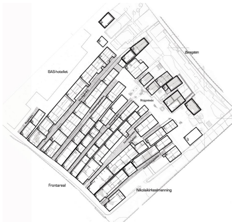
Closure of the buildings at the site.

The buildings at Bryggen today consist of criss-cross layers of logs placed on the ash from the latest fire. Over the logs, there are timber constructions with often three stores high. The galleries are located along the passageway side, that were also used as working space for weighing and sorting the fish. The goods were transported by the hoist wheels in dormer structures which can be seen from the passageways (Prosjekt Bryggen; Dagsland, 2004).