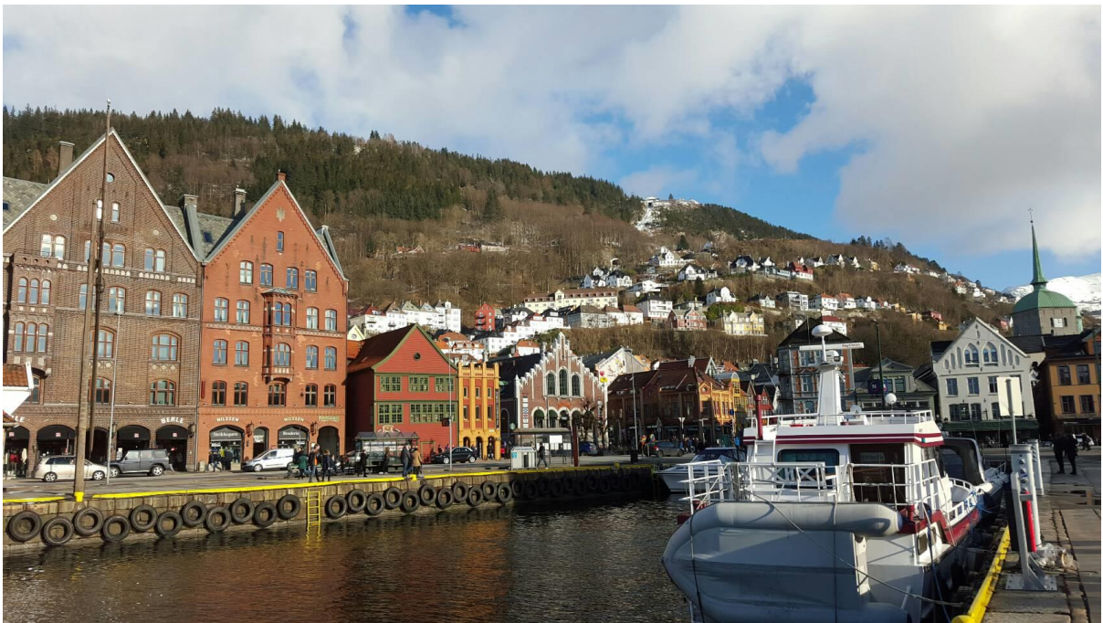
View towards the Hanseatic Museum and Fløyen.

What opportunities, dilemmas and challenges are facing the site managers at the UNESCO World Heritage site, Bryggen in Bergen? And what potential conflicts arise among the site managers, and how can such divergences be solved?