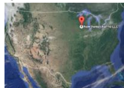
Figure 3 - New Forest Farm location

The trees, buildings and pastures are laid according to the topography, "with keyline swales designed to accept the excess water during large rain events water is captured and moved to the pocket ponds and overall toward the ridges. (...) some ponds may indeed be intentionally designed to do so throughout the driest months of summer." 19