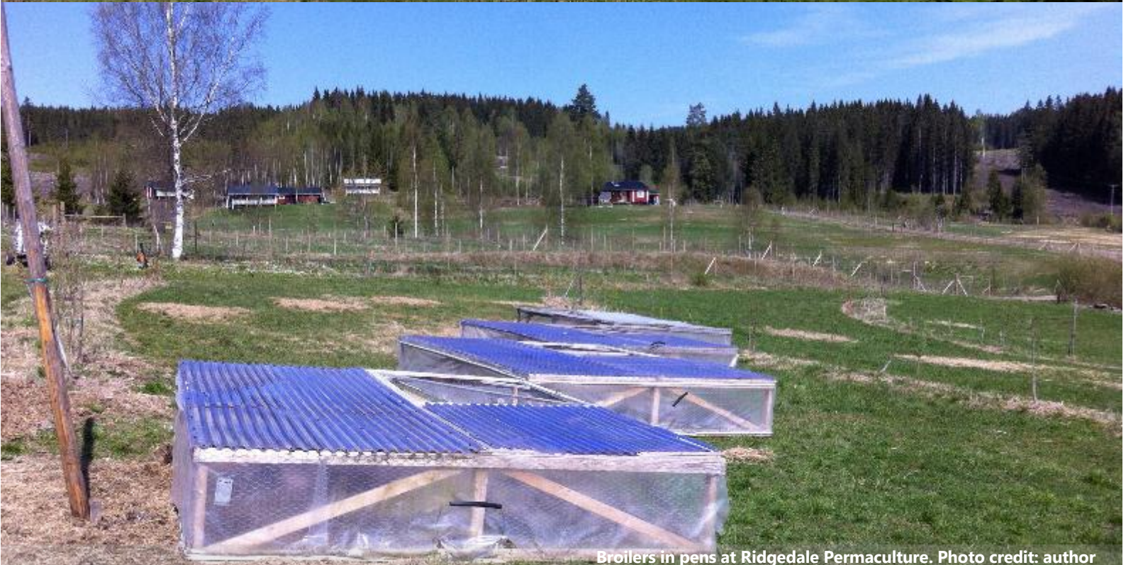
Broilers in pens at Ridgedale Permaculture.