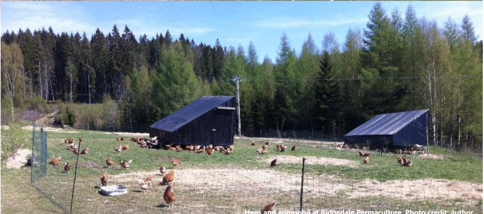
Hens and eggmobil at Ridgedale Permaculture.