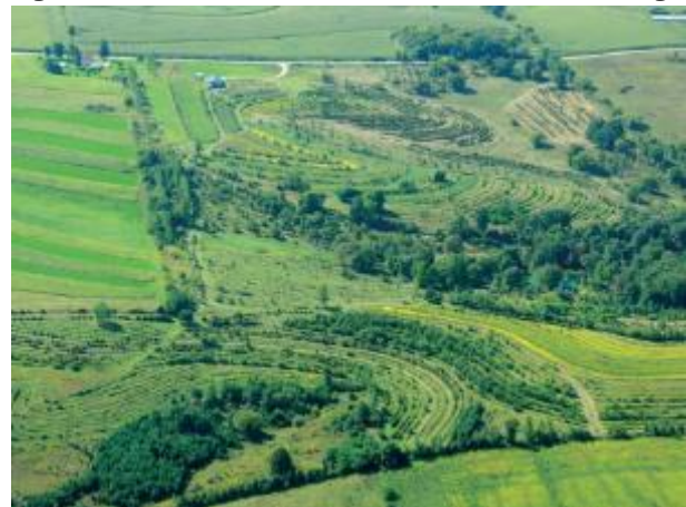
Figure 4 - Photo of New Forest Farm and surroundings