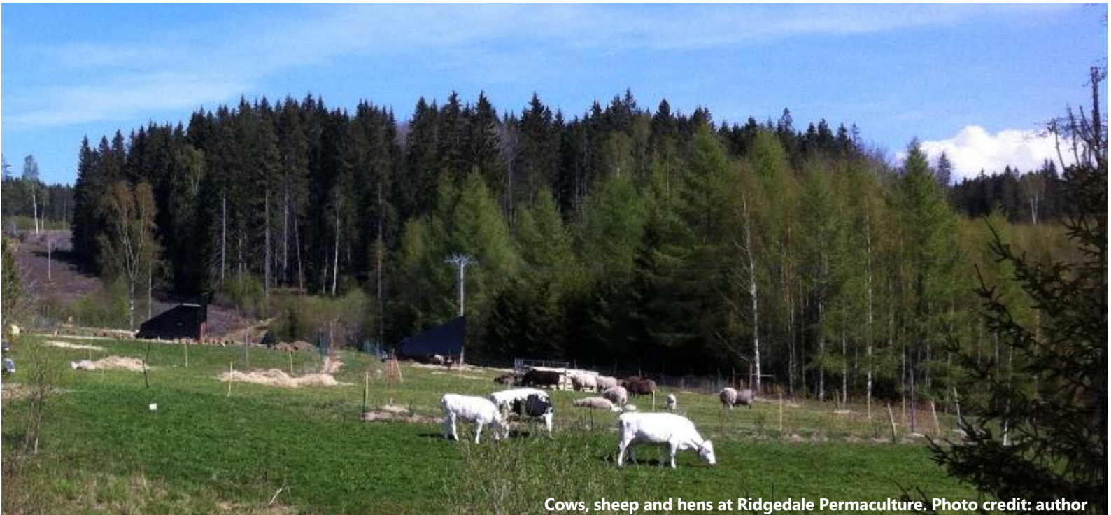
Cows, sheep and hens at Ridgedale Permaculture.