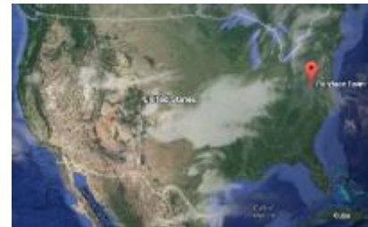
Figure 2 – Polyface Farm location

Polyface Farm is Virginia’s Shenandoah Valley 16 km from Staunton (25,000), Virginia. The biome is temperate broadleaf and mixed forests 75 . The climate is humid continental (Dfa/b) 76 , with ~1000mm of well distributed rainfall and temperatures going below -20°C or above 30°C only in few days a year.