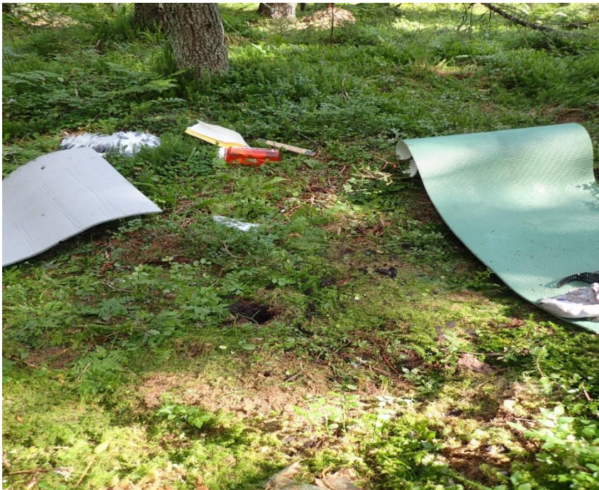
Figure 3: The sampling site.

Peat cores were taken in the end of August 2015 with a Russian corer (Jowsey 1966) of 5 cm in diameter and 50 cm in length. Total length of the peat cores was 149 cm. The first 4 cm were cut with a knife. Each core of 50 cm were cut in 1cm thick slices in the field and put in plastic zip-lock bags right away. The plastic bags were marked with a sample number and how many cm below the surface the sample derived from. The samples were stored in a refrigerator with 4-5 °C until preparation and analysis. Vegetation types were classified with Fremstad (2007) and vascular plant names follow nomenclature by Lid et al. (2005).