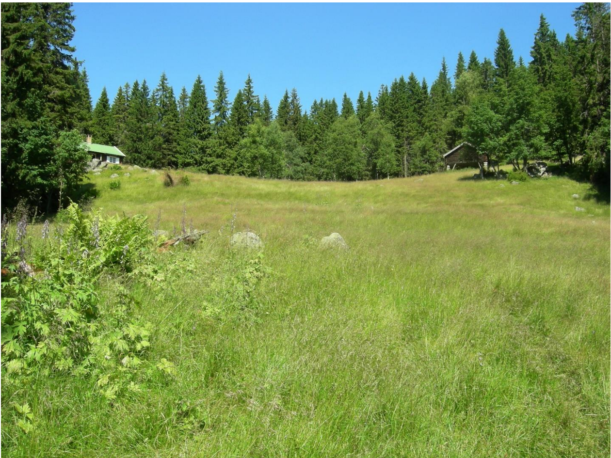
The summer farm Finnerudseter