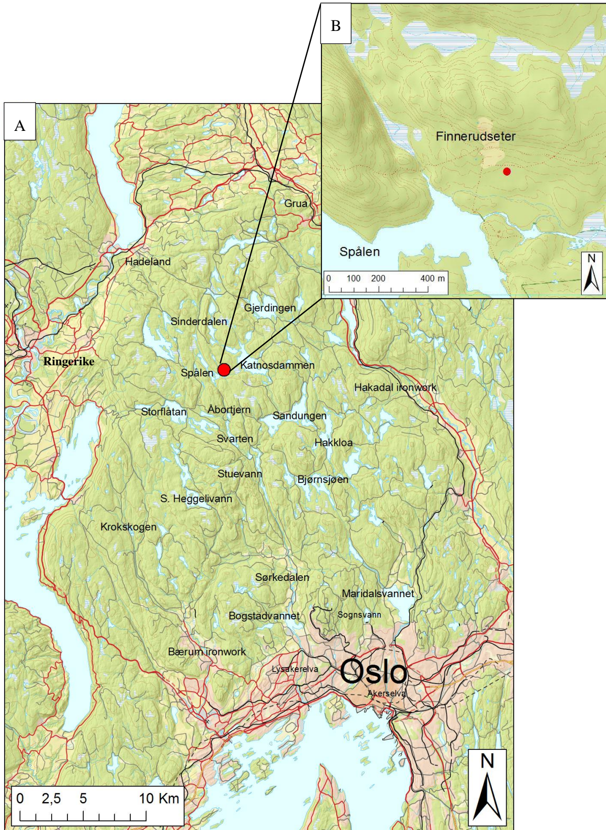
Figure 1: Map showing the forests of Nordmarka in relation to Oslo and location of the sampling site (A), and the sampling site at Finnerudseter (B).