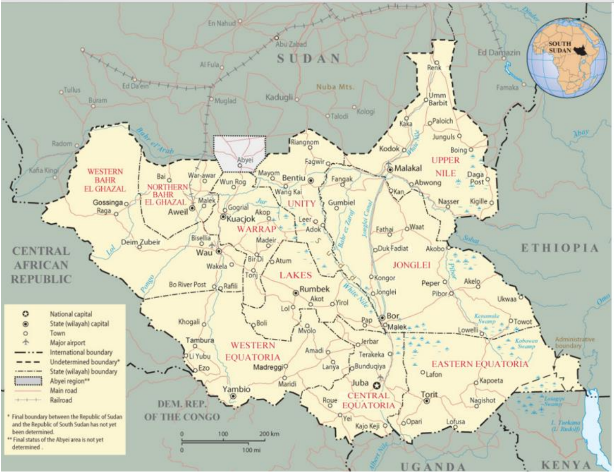
Figure 1 Map of South Sudan

Source: http://www.geographicguide.com/pictures/south-sudan-map.jpg -final status of the Abyei area in not yet determined.