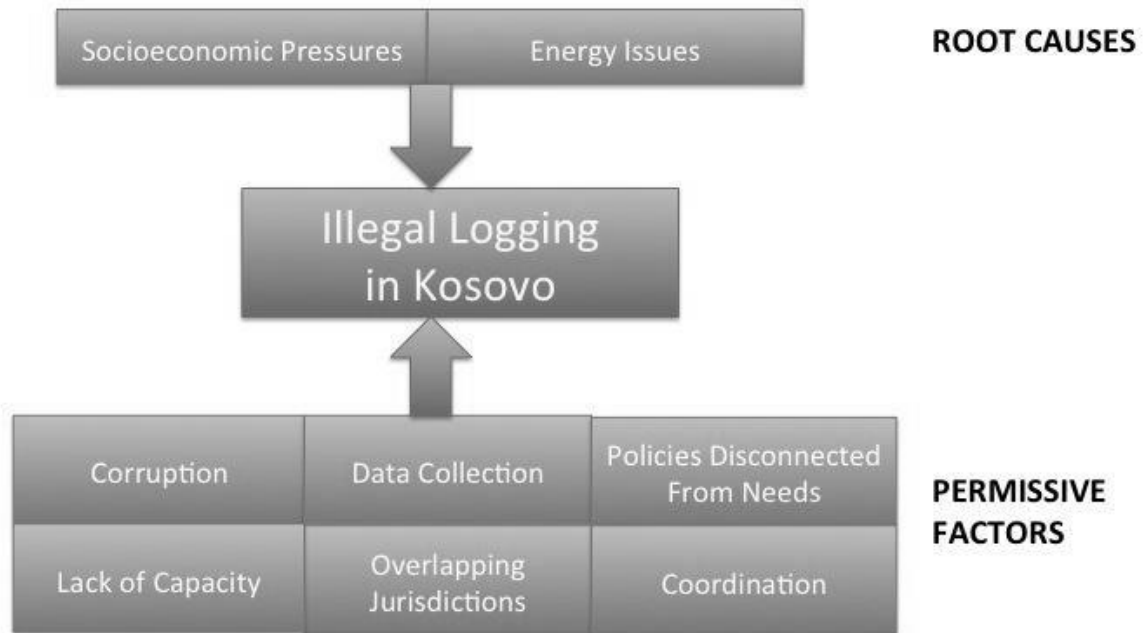
Figure 2: Causes and permissive factors of illegal logging in Kosovo (Bensky et al, 2013).

Poverty and unemployment are the key drivers in illegal logging. One-third of the population lives below the poverty line and the cheapest way to heat a household remains firewood.