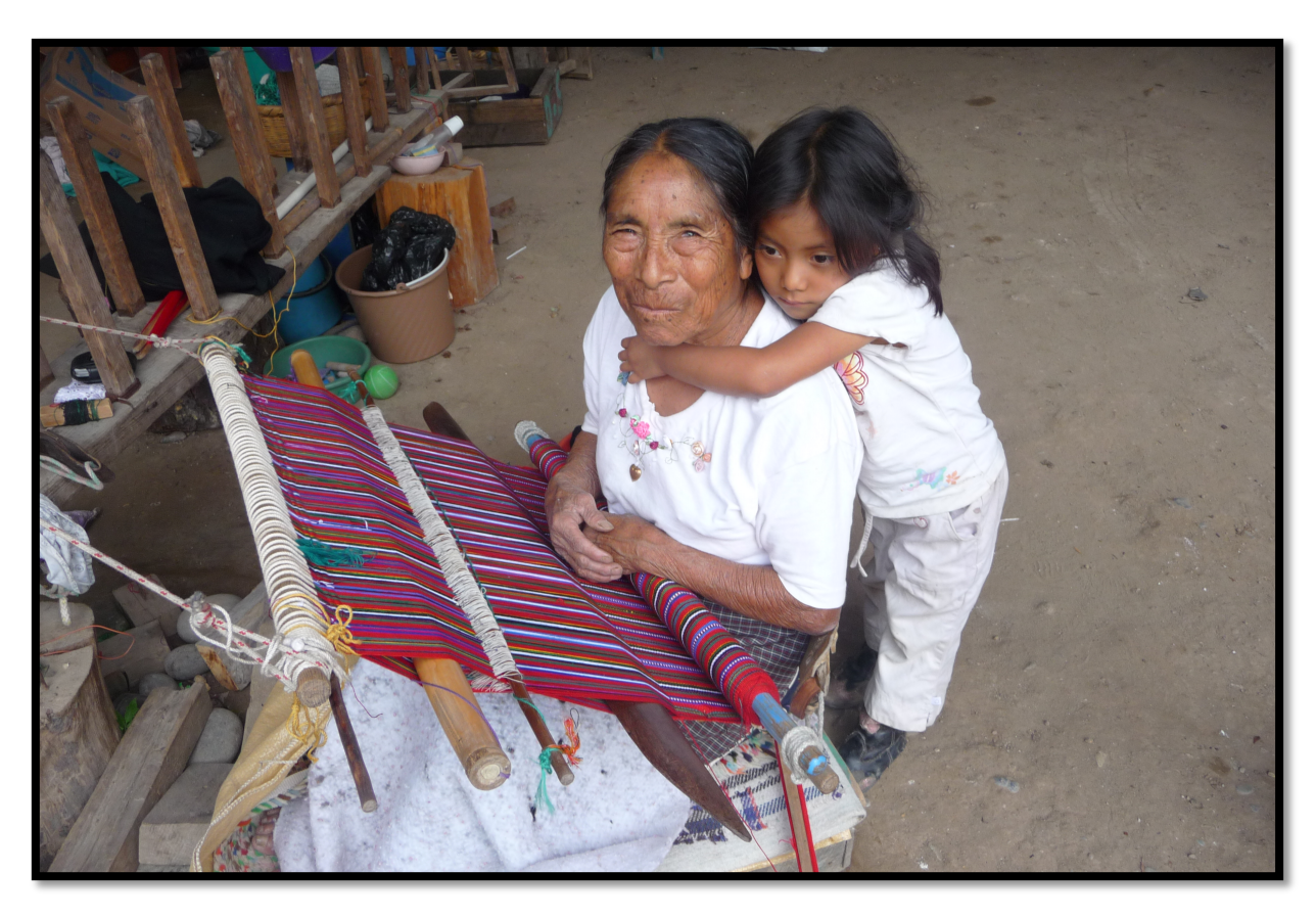
An old lady in Aguacatán weaving on a traditional loom.